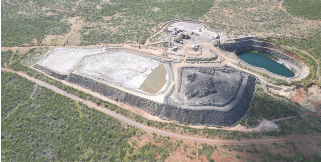
Figure 2 – Overhead of Lorena plant, tailings and waste rock stockpiles and open pit

At the centre of the Cloncurry package is the permitted 280,000tpa Lorena CIL and flotation plant, commissioned in 2018 at a capital cost of more than A$50 million. Independently valued (on a replacement value basis) at over A$30 million recently, the plant was designed for long-term regional use, featuring SAG and ball mills, flotation circuit for sulphidic ores and a four-stage CIL system. It sits only 15km east of Cloncurry on sealed roads with an established water supply, providing the Cloncurry Gold Project with a rare, low-capital cost restart pathway and a potential toll-treating hub for third-party feed.