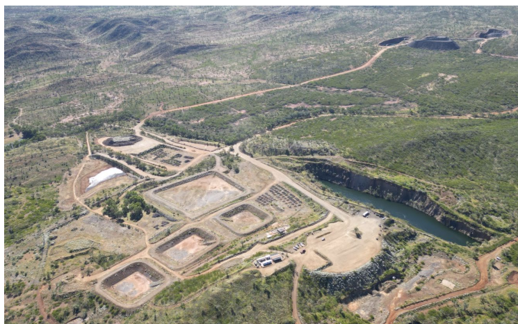
Figure 3 – Overhead of Mt Freda Complex, including open pit and proposed VAT processing Golden Mile Complex – high grades on granted mining leases

Mt Freda is one of Cloncurry's most recognised historic gold mines, producing significant ounces in the late 1980s and early 1990s when open pit mining exposed high-grade shoots within brecciated quartz-carbonate lodes. Subsequent operators including Ausmex and Tombola defined JORC-compliant resources and drilled extensions demonstrating that the system remains open along strike and at depth. Flanked by the Shamrock and Comstock pits on granted mining leases, Mt Freda forms the backbone of AuKing's near-term restart potential, with haulage roads and infrastructure already in place.