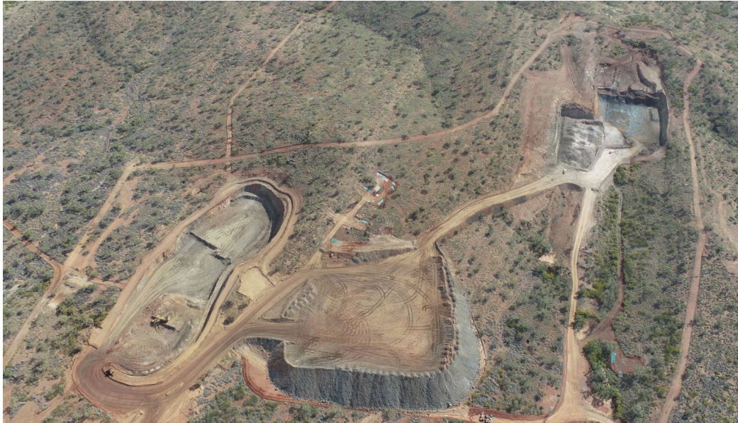
Figure 4 – Overhead of Golden Mile Complex, Comstock pit to the left and Shamrock pit to the right

Only 600 metres north of Mt Freda, the Golden Mile complex hosts a series of parallel shear-hosted lodes historically worked by underground and open pit methods. Modern drilling in 2022 returned high-grade intercepts confirming the continuation of mineralisation at depth and along strike. With Shamrock and Comstock pits already established, Golden Mile represents a low-cost, high-impact satellite to the Lorena processing plant, offering immediate resource definition and development upside.