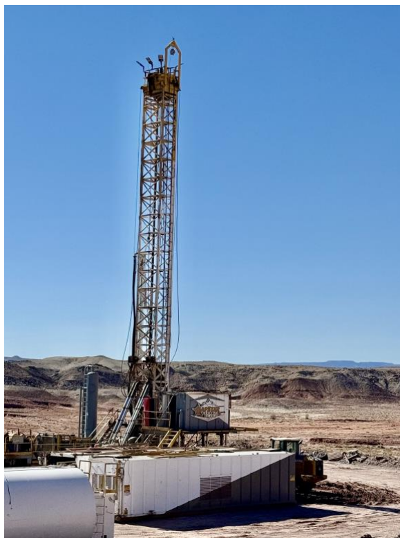
Figure 1: The drill rig set up on the Mt Fuel-Skyline Geyser 1-25 well pad.

Anson Resources Limited (ASX: ASN ) (“Anson Resources” or the “Company”) through its 100% owned subsidiary Blackstone Minerals NV LLC is pleased announce that it has commenced its re-entry drilling program of the Mt Fuel-Skyline Geyser 1-25 well, see Figure 1, at its Green River Lithium Project (Project) in south-eastern Utah, USA. The aim of the program is to confirm lithium rich brines are located in the target horizons, which will be used to increase the overall Project JORC Mineral Resources in addition to the Resources announced at the Bosydaba #1 well 12km to the north (ASX announcement 123 June 2025), see Figure 2.