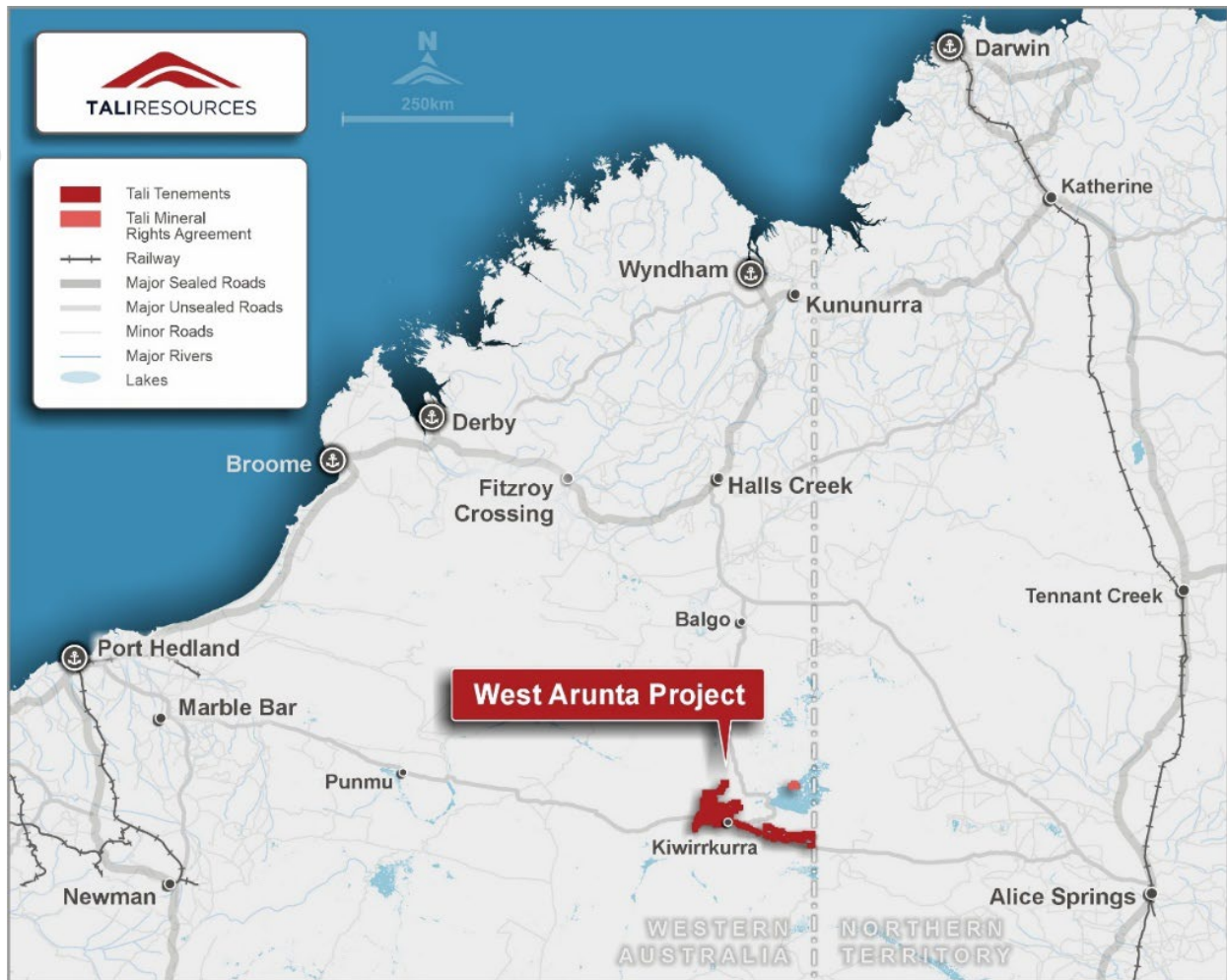
Figure 1. Location of the West Arunta Project as at 30 September 2025