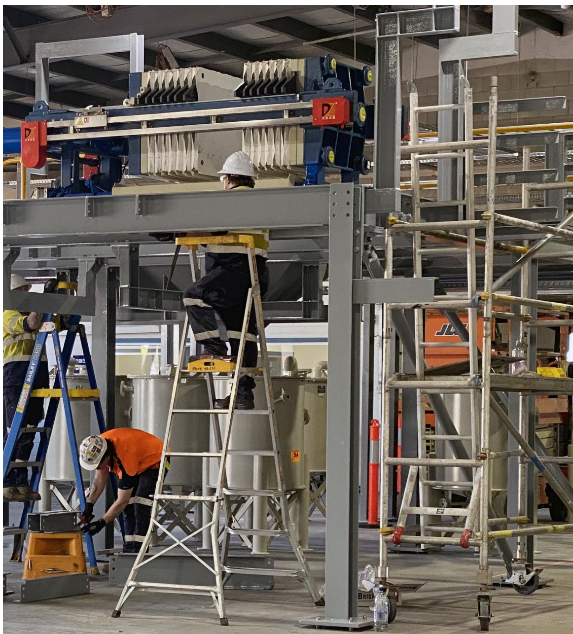
Figure 1. Construction works at PSG demonstration facility in Adelaide

With recently announced Chinese export restrictions underscoring the risks of over-reliance on Chinese graphite supply, the demonstration plant positions Renascor, and Australia more broadly, to play a leading global role in establishing secure, sustainable ex-China supply chains for battery anode materials."