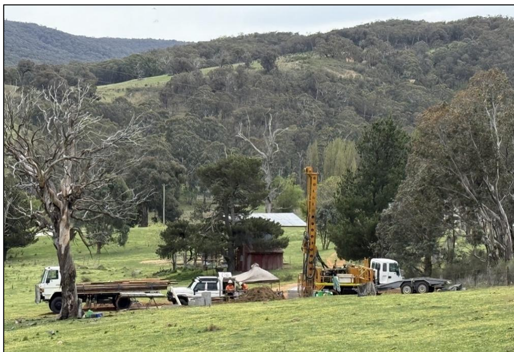
Figure 1 – Diamond drill rig at Argent’s wholly owned Kempfield Polymetallic Project

Argent Minerals would like to thank Orange-based drilling contract Chief Drilling Pty Ltd for the safe and successful diamond drilling program.