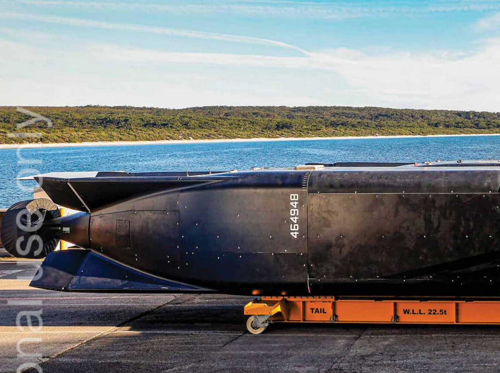
Ghost Shark-prototypes developed for the Australian Navy.