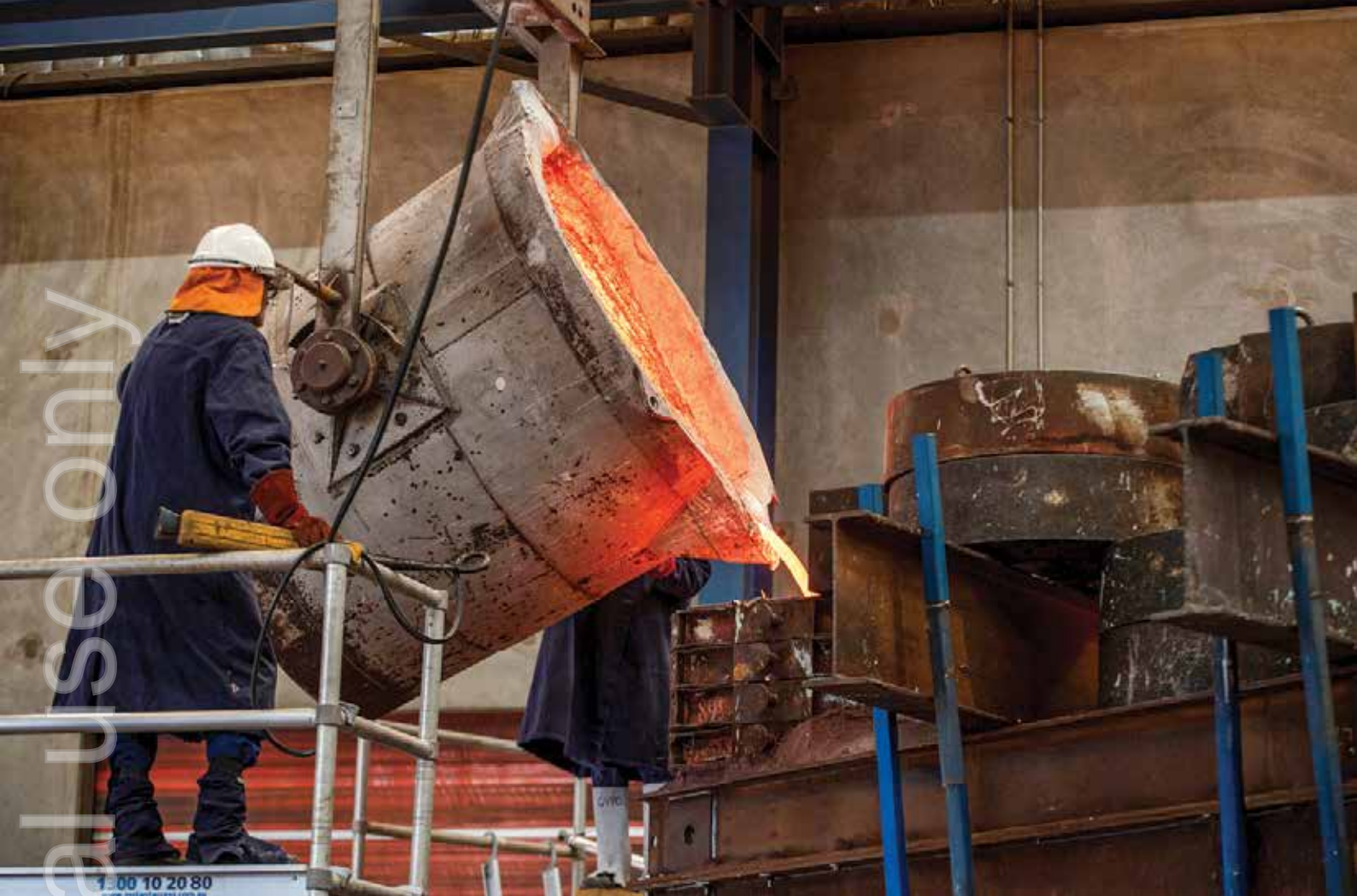
15.5 tonne casting being poured