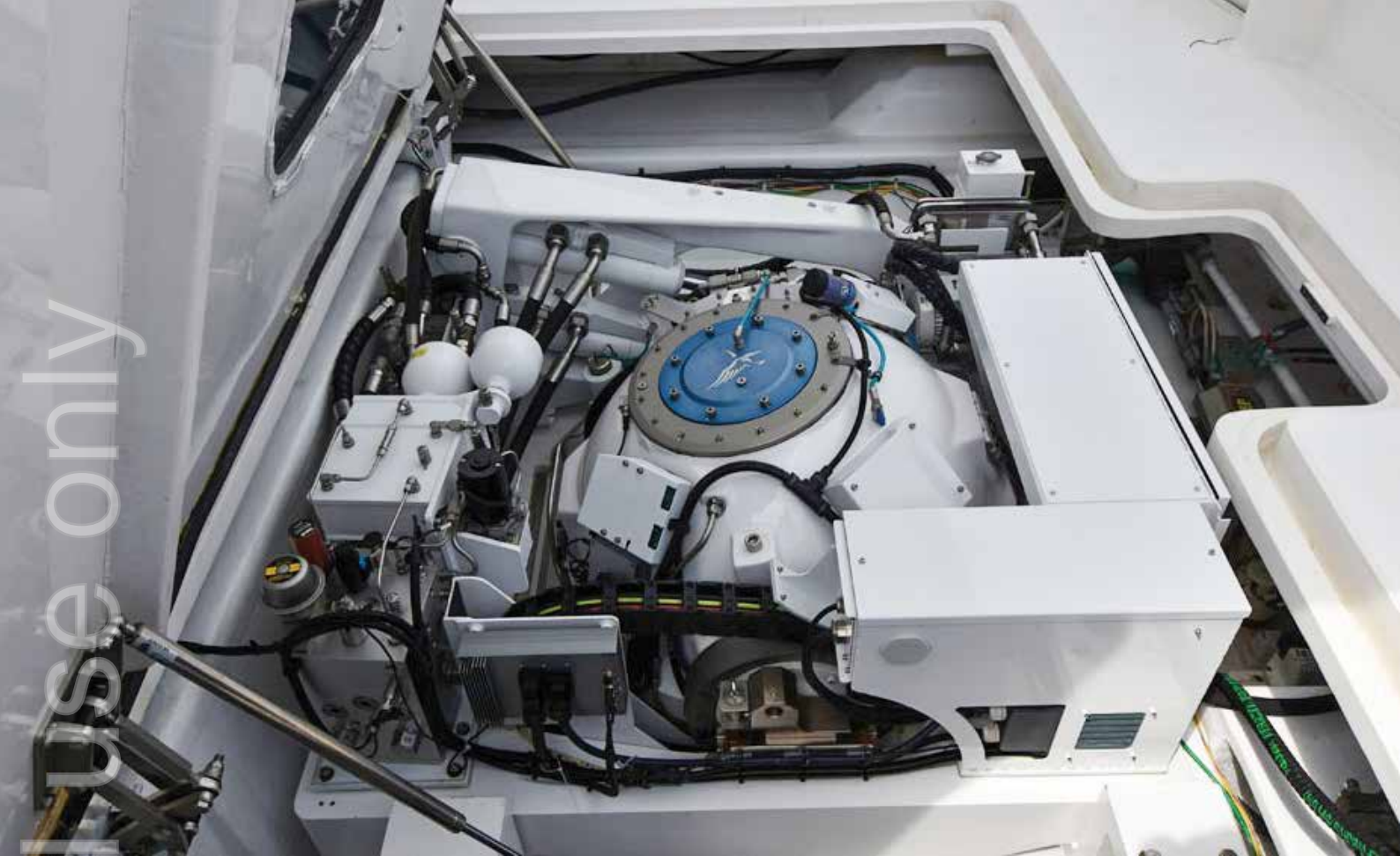
VG52 installed on the VEEM test vessel