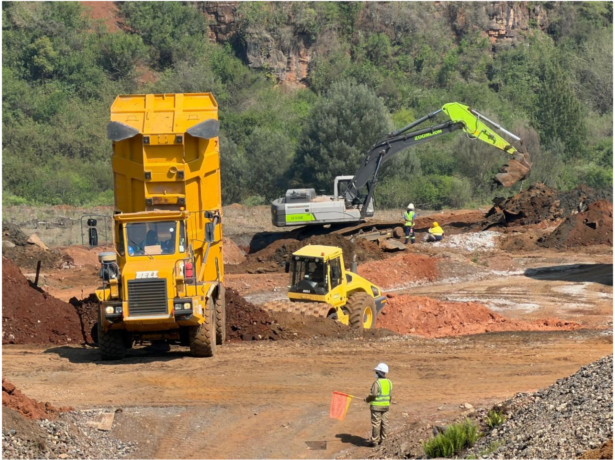
Figure 6: Earthworks on Platform 4