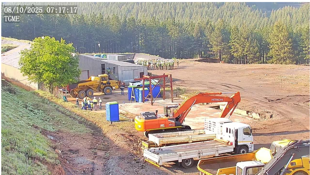
Figure 9: Safety toolbox meeting before starting work