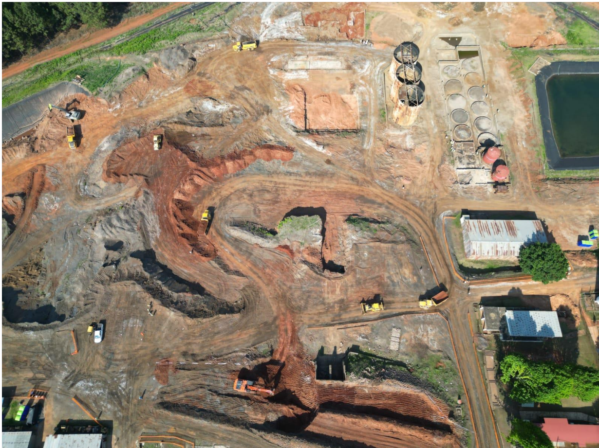
Figure 3: Aerial View of Plant Footprint Progress