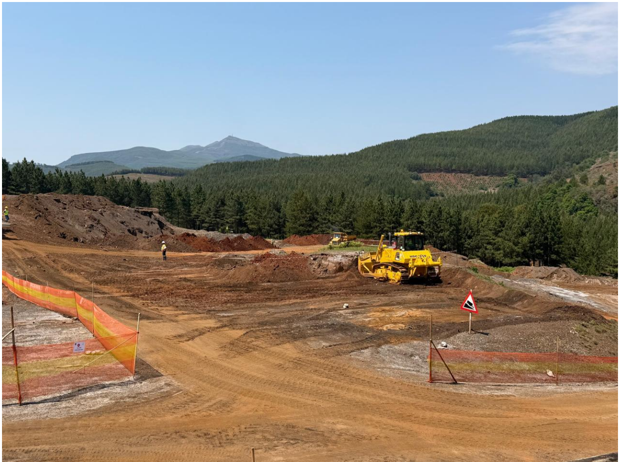
Figure 7: Earthworks on Platform 2