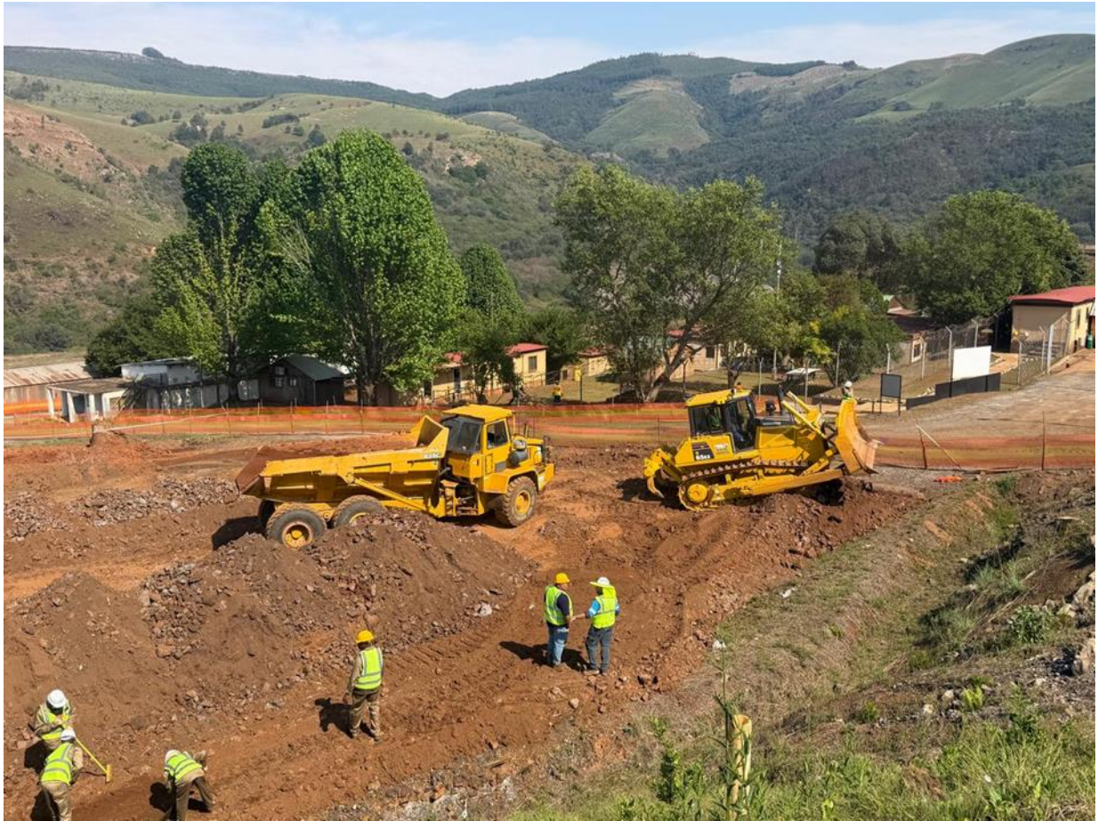
Figure 4: Earthworks on Platform 2