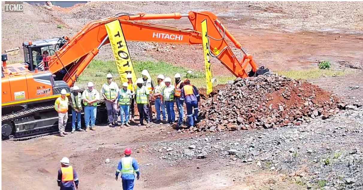
Figure 1: TGME Project - Breaking New Ground

Theta Gold Mines Limited (ASX: TGM, the “Company”) has reached a significant milestone at its TGME Gold Mine Project. All contractors and equipment are now fully mobilised, enabling bulk earthworks to ramp up on schedule. Heavy machinery is shaping the site for major infrastructure, while civil works have commenced at the Carbon-in-Leach (CIL) section and retaining walls, critical steps toward building a robust, efficient processing plant.