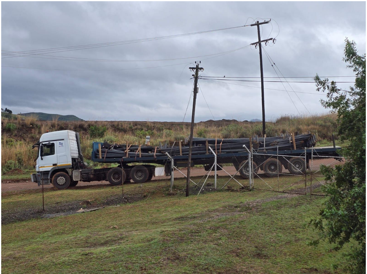
Figure 5: Steel reinforcing being delivered