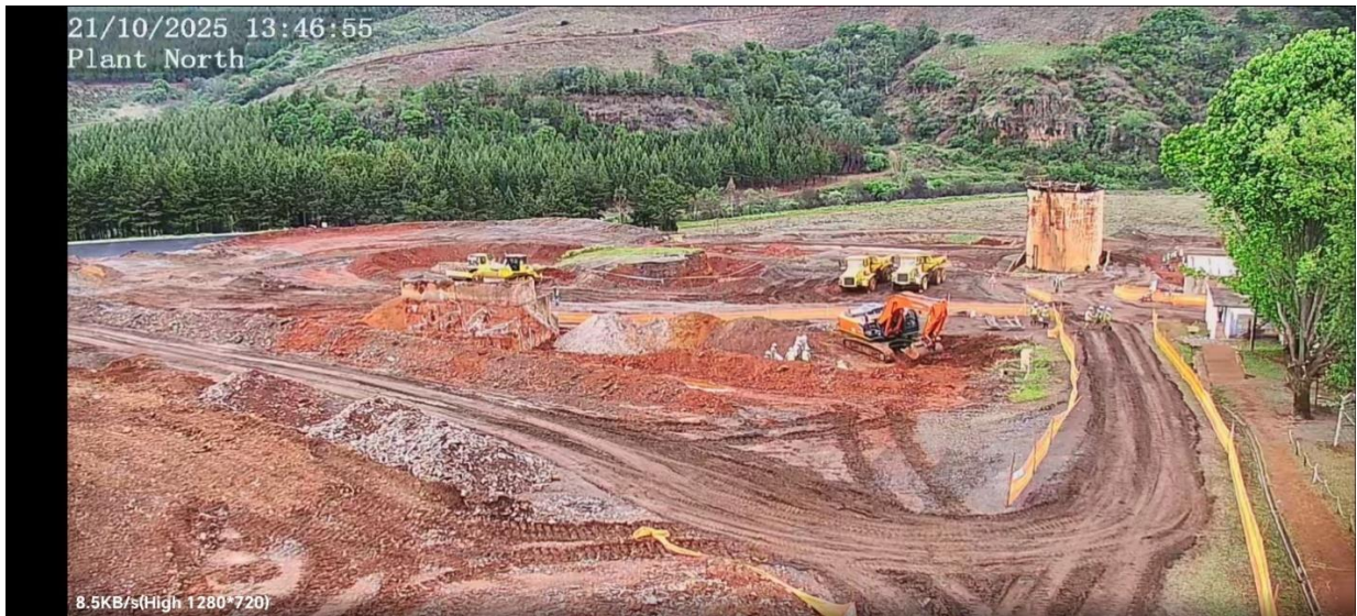
Figure 8: 21/10/2025 General Site Overview