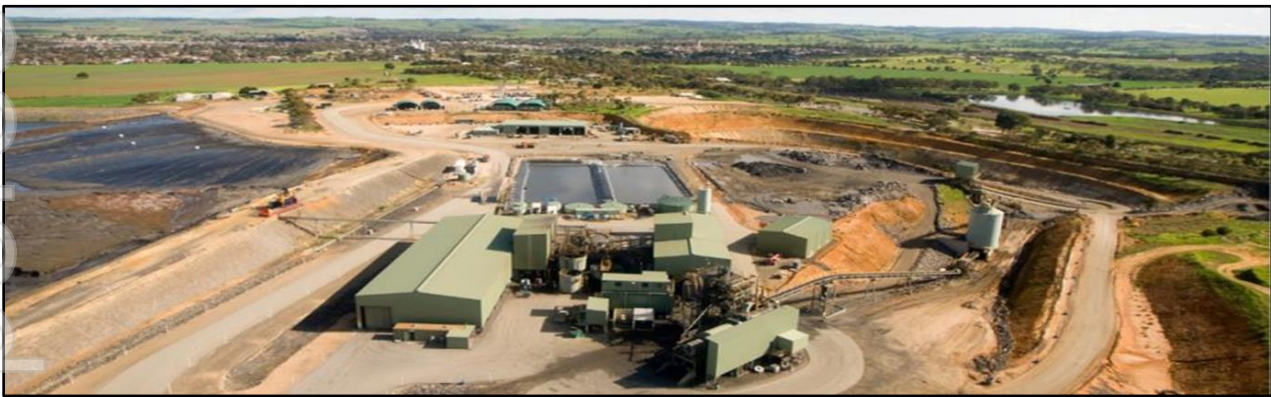
Figure 2: Angas Mine (100% TZN) Existing Processing Plant

Expenditure: A total of $0.3 million was incurred during the quarter for legal costs, regulatory compliance and site upkeep.