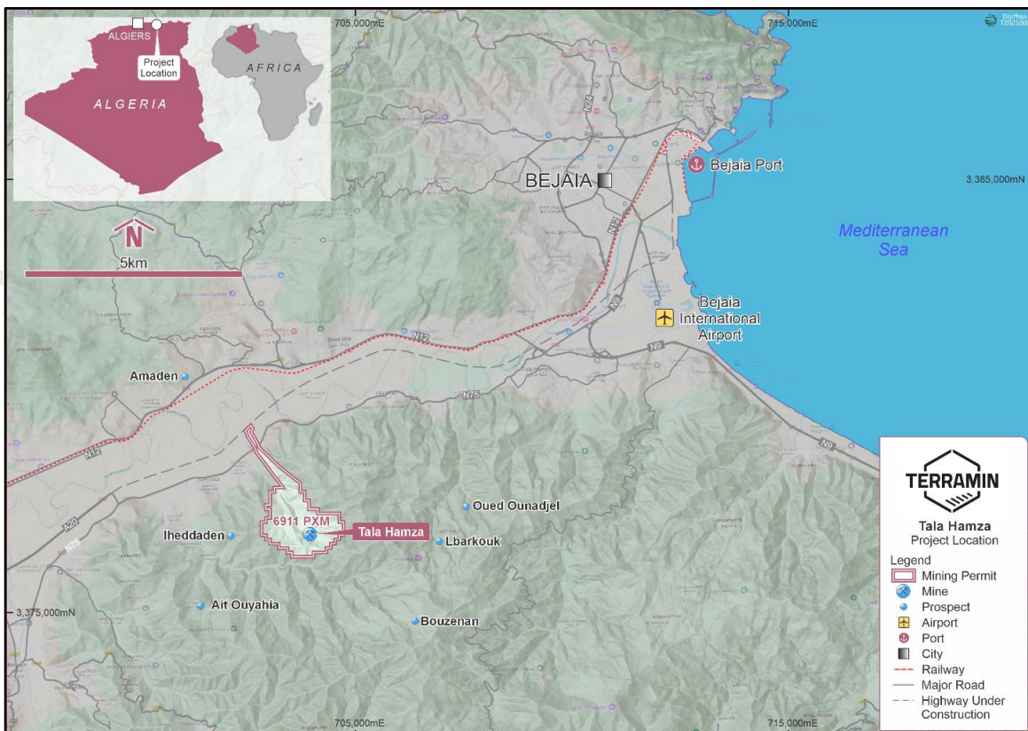
Figure 1: Tala Hamza Project Location and Infrastructure

Expenditure: Terramin’s share of costs for the quarter totalled $0.1 million.