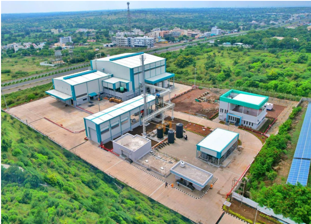
Figure 2 – Evion’s brand new, state-of-the art, purpose-built Expandable Graphite production facility near Pune, India