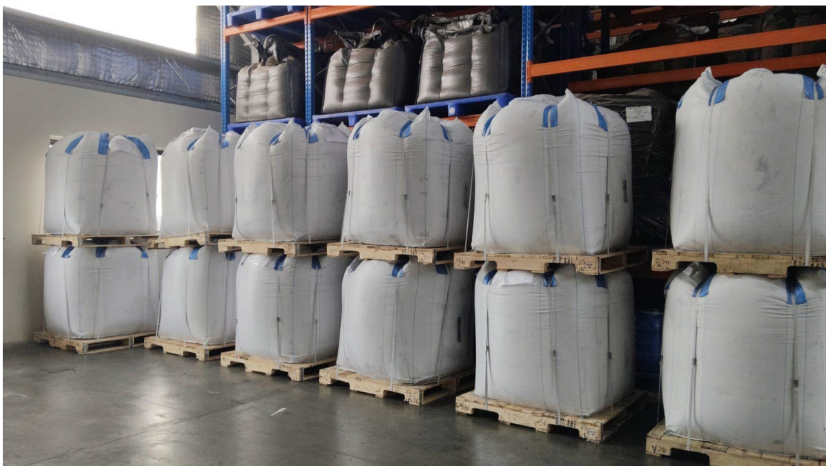
Figure 1 – Expandable graphite recently shipped to the USA

Panthera Graphite Technologies is a 50:50 joint venture (JV) established with Metachem Manufacturing Co, an experienced expandable graphite producer near the city of Pune in India with over 20 years' operating history. Panthera's production facility is located in a Special Economic Zone, adjacent to key transport infrastructure. Operations commenced Q4 2024, with the first shipment made in March 2025.