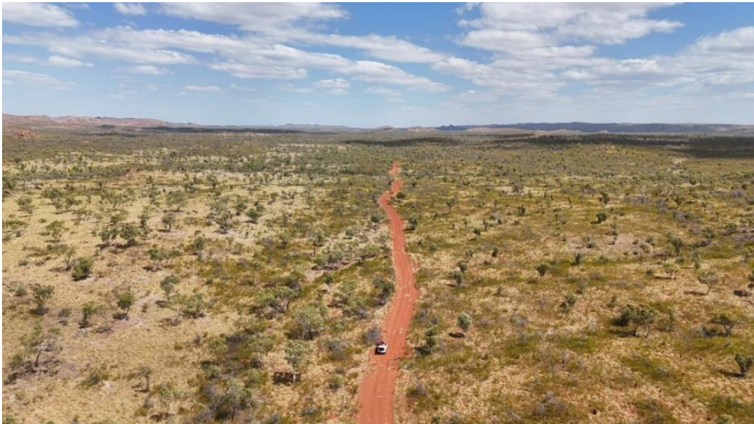
Figure 1 Ardmore North Project aerial view looking South