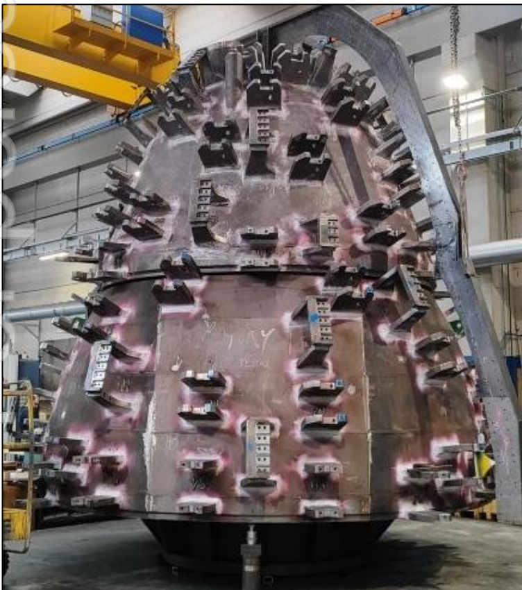
Figure 2: Blind bore cutter head ready for shipment