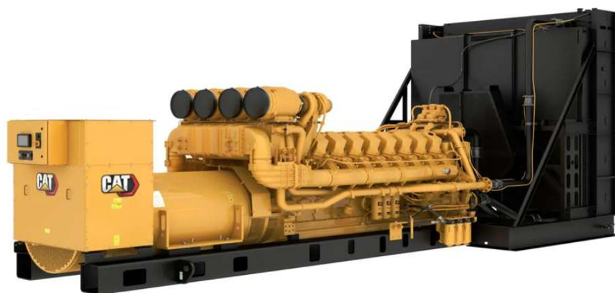
Figure 1. CAT 175-16 Diesel Powered Genset