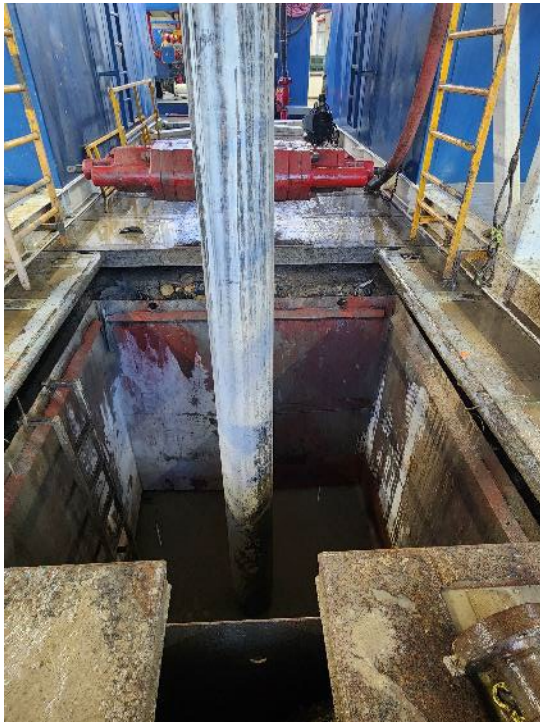
Figure 1 - Surface casing set in place

At the end of the period, the Amistad-2 surface casing had been set and cemented (Figures 1 and 2) at 327 metres measured depth and oil impregnation of formation samples and oil-sheen had been noted on the shakers during the drilling of this upper non-reservoir section. The well was drilling ahead towards the expected oil reservoirs.