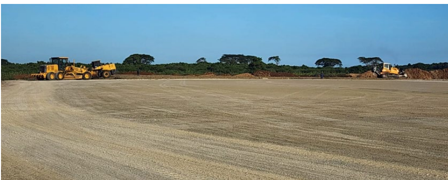
Figure 3 - Construction of pad for Amistad-3 was completed.

Preparations for the contingent drilling of Amistad-3 were further advanced. Civil construction of the well pad, rig-camp location and access roads were completed during the reporting period (see Figure 3). The Amistad-3 permit to drill is in-hand and all necessary material drilling equipment arrived in Cuba during the prior quarter.