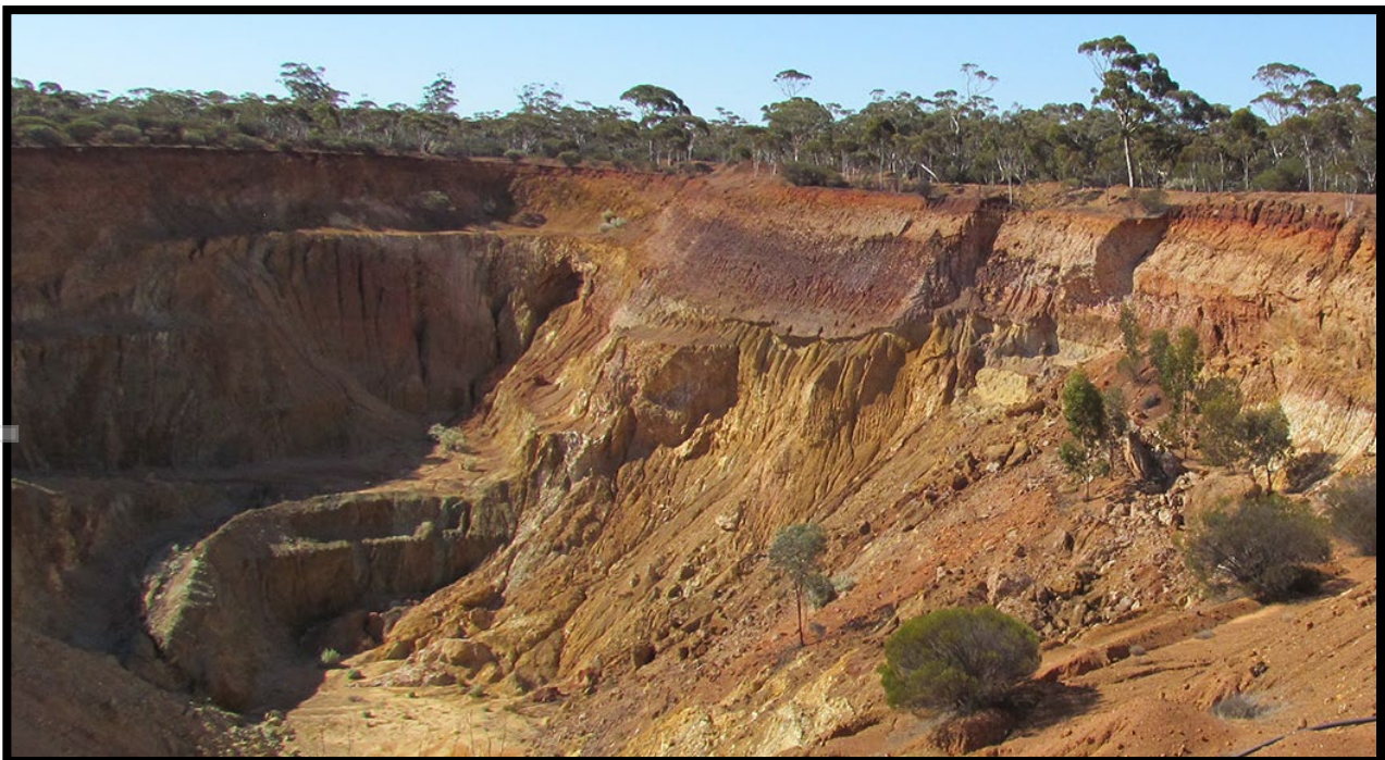
Figure 1: Mt Dimer Gold Taipan pit, view to northwest

MEGA Resources Pty Ltd 2 is an Australian subsidiary of Bain Global Resources, which is part of the BGR Mining & Infra group 3 . BGR is one of India's largest mining contractors, with an order book valued at over AU$24 billion. MEGA was founded in Western Australia to offer comprehensive mining solutions, specializing in mine planning, engineering, and operations. MEGA has already engaged in a number of significant gold projects and partnerships in WA.