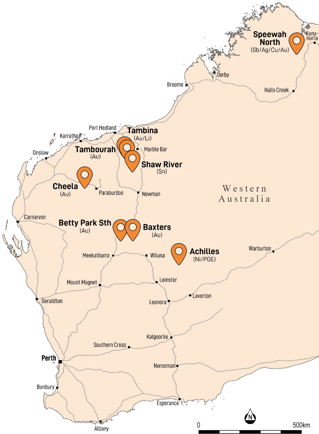
Figure 3: Tambourah Metals Project Locations