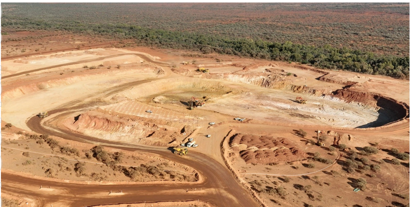
Figure 2: Crown Prince Gold Mine

NMG reported significant progress at Crown Prince as mining operations ramped up. Ore and waste movement advanced smoothly, with material from early blasts used to construct key infrastructure including the ROM and crusher pads.