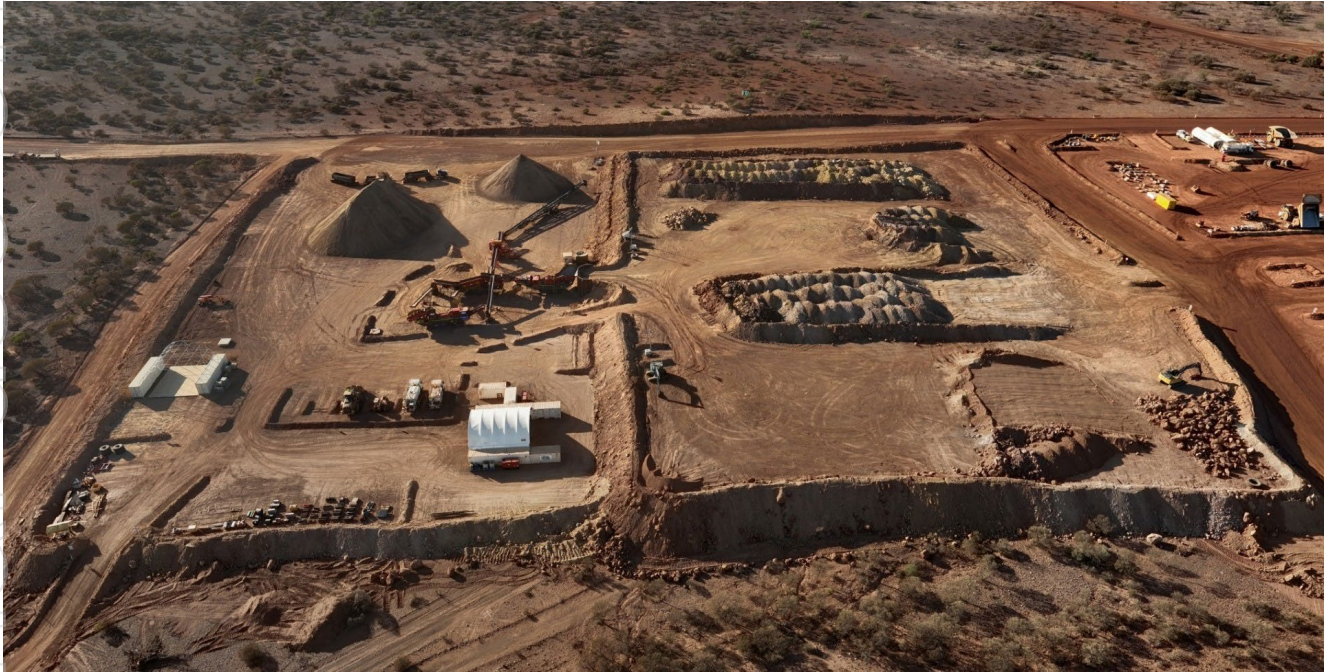
Figure 3: Crown Prince Gold Mine ROM, Crusher and Crushed Ore product stockpile area

Crushing and sampling commenced in August, with collection of the first ore parcel commencing on 7 September 2025 under the Ore Purchase Agreement with Westgold Resources.