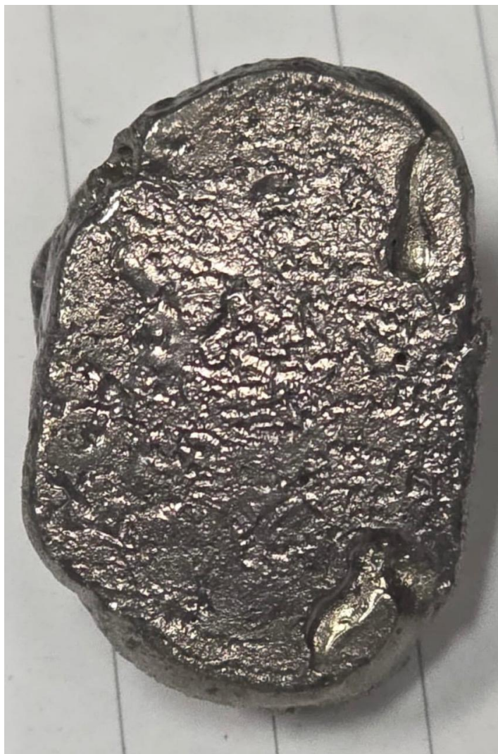
Figure 2: Mojave 100% American Made Antimony Ingot

demonstrated the technical feasibility of restoring antimony refinement in America for the first time in decades and provided a tangible foundation for future downstream processing and government engagement under the Defense Production Act and Inflation Reduction Act frameworks.