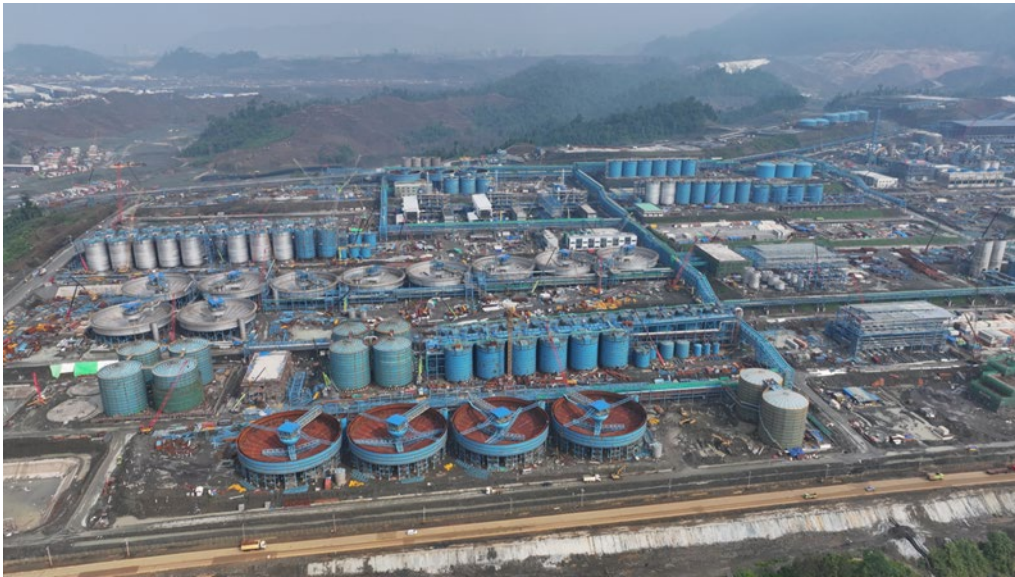
ENC HPAL Smelter construction progress

Nearby at the Refinery, key reagents that will be used to extract valuable metals have commenced delivery in anticipation of commissioning solvent extraction. Final optimisations are being completed to the Refinery to enable full commissioning of the end-to-end process next quarter, which will result in finished nickel and cobalt products suitable for the battery chemical and super alloys markets.