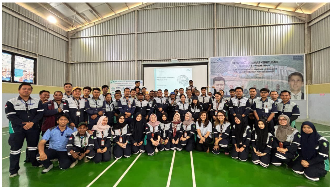
World Mental Health Day

Further RKEF detail is contained in Appendix A.