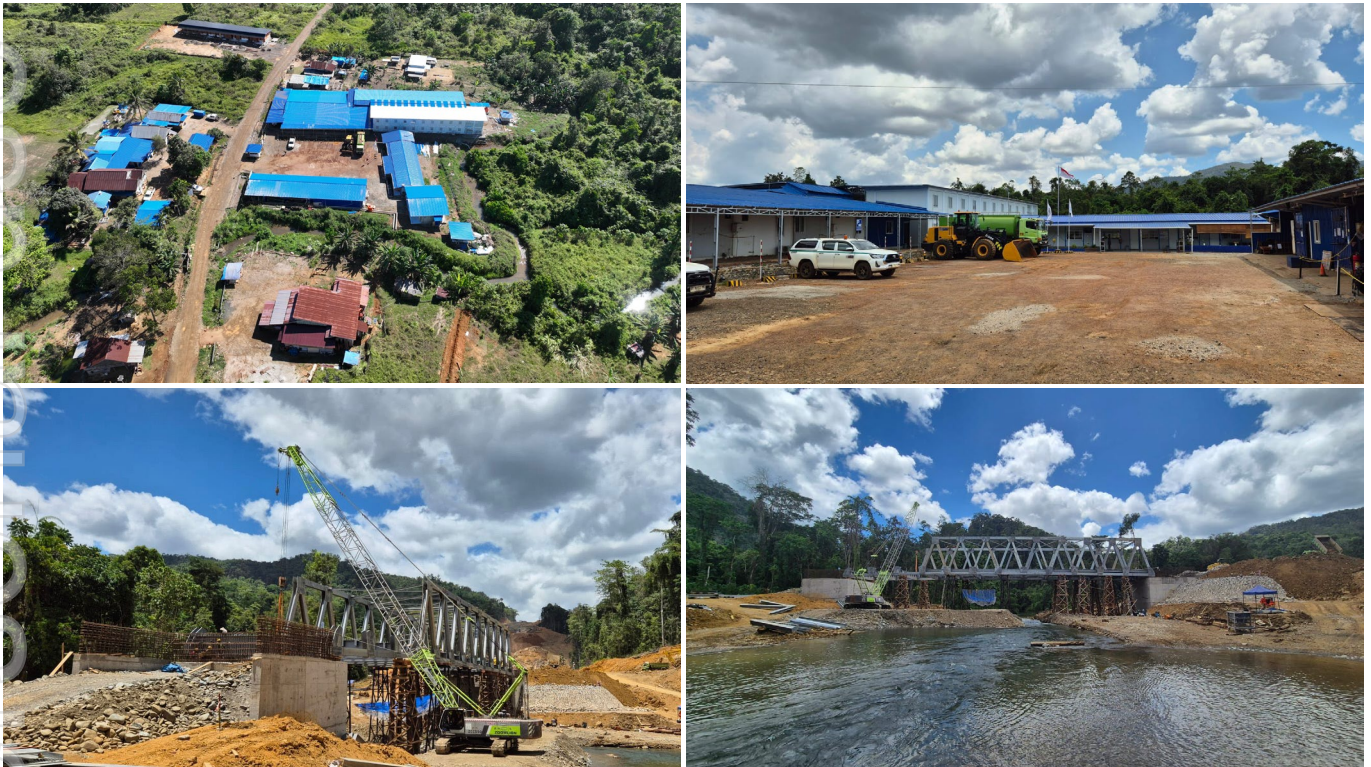
Sampala Mine camp and bridge construction

Construction of 8km of haul road, a 60-metre bridge, internal road systems and stage one accommodation is progressing well. The construction activities have resulted in the creation of approximately 800 new jobs. During the quarter, drill rigs completed 767 drill holes for 23,133 metres. Exploration drilling focus has shifted to the GF exploration area whilst infill drilling programs have commenced in the ANN IUP area to support detailed mine planning.