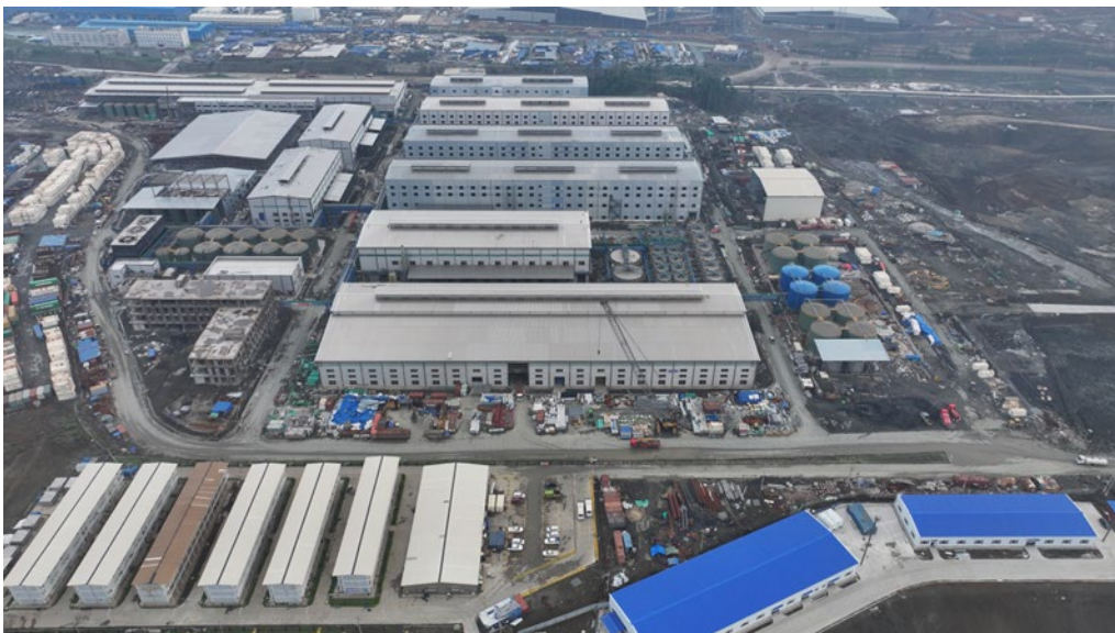
ENC integrated Sulfate and Cathode refinery construction progress