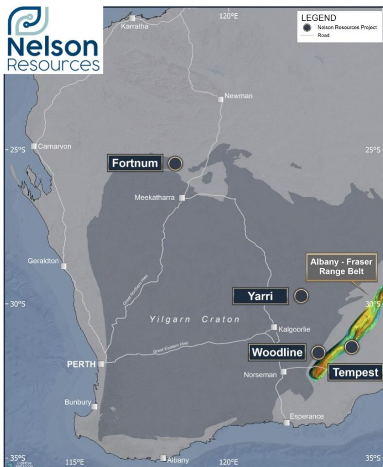
Figure 1: Project Locations.