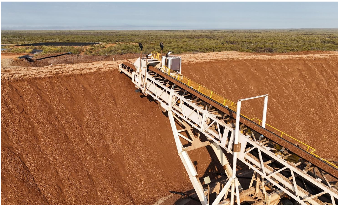
Figure 3: Heap Leach Pad 18 Stacking