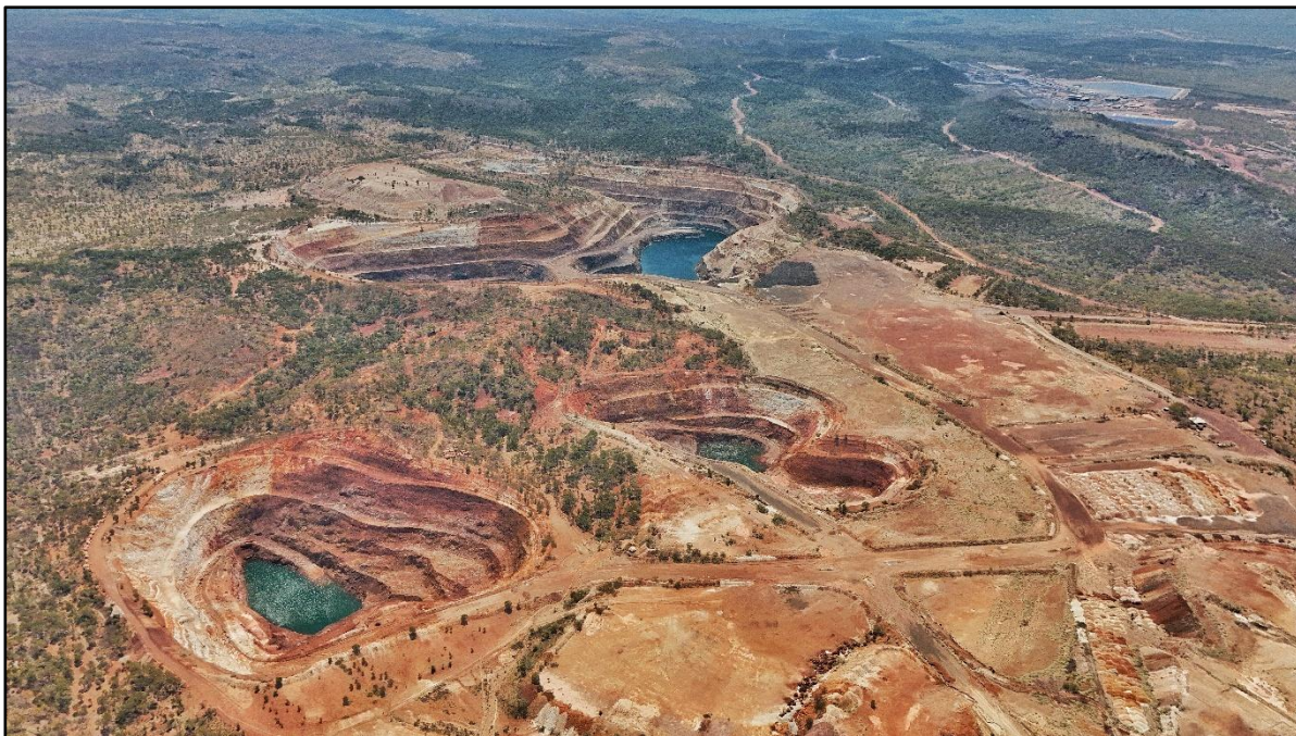
Figure 5: Drone footage overlooking the Lady Brenda (foreground) and Lady Annie Pits, with Lady Loretta Mine in the background.

As Austral's asset acquisition and consolidation strategy continues to accelerate across the Mount Isa and Cloncurry Regions, the Exploration and Resource Development Team is proactively integrating the new assets into the development pipeline and prioritising high-impact, near-term drill targets. Several areas of focus have been identified across the Lady Annie, Flying Horse, Lady Colleen, McLeod Hill, Enterprise and Rocklands resource areas, with work expected to begin immediately upon finalisation of capital raising efforts.