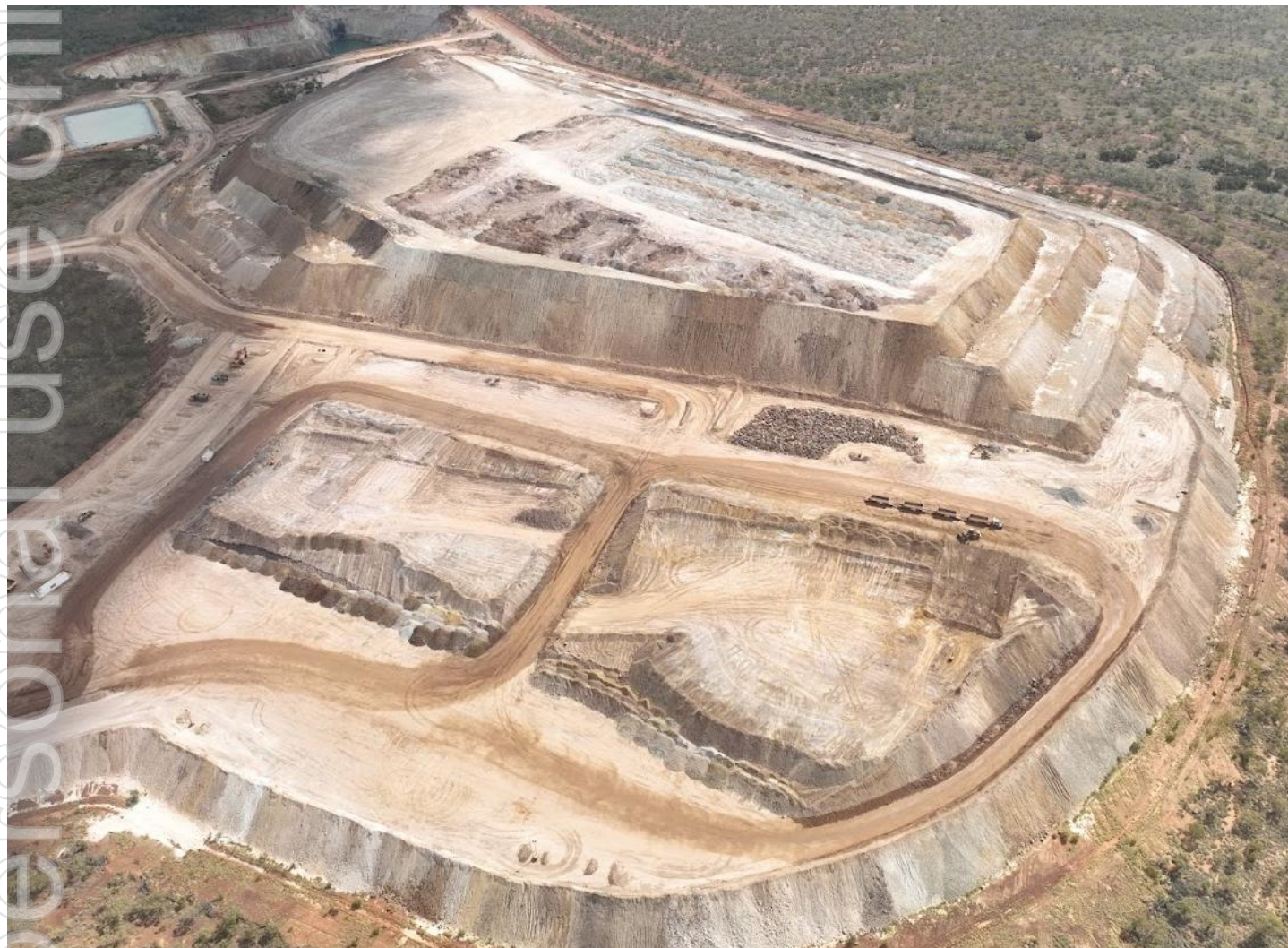
Figure 2: Anthill ROM