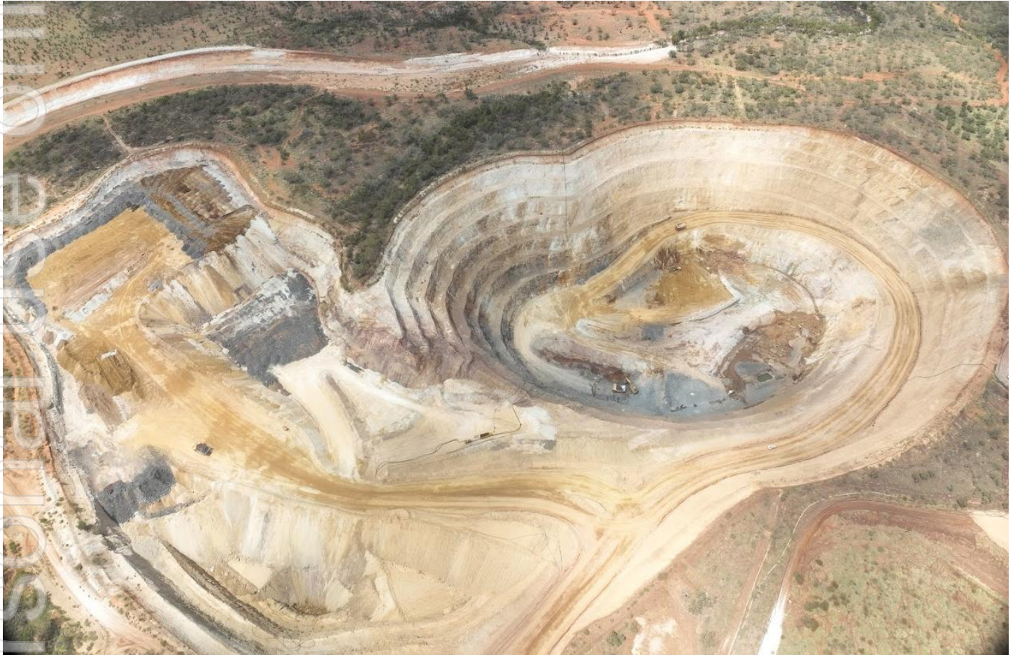
Figure 1: AHE Stage 1 Backfill Waste Dump (foreground) and E2 Pit (background)