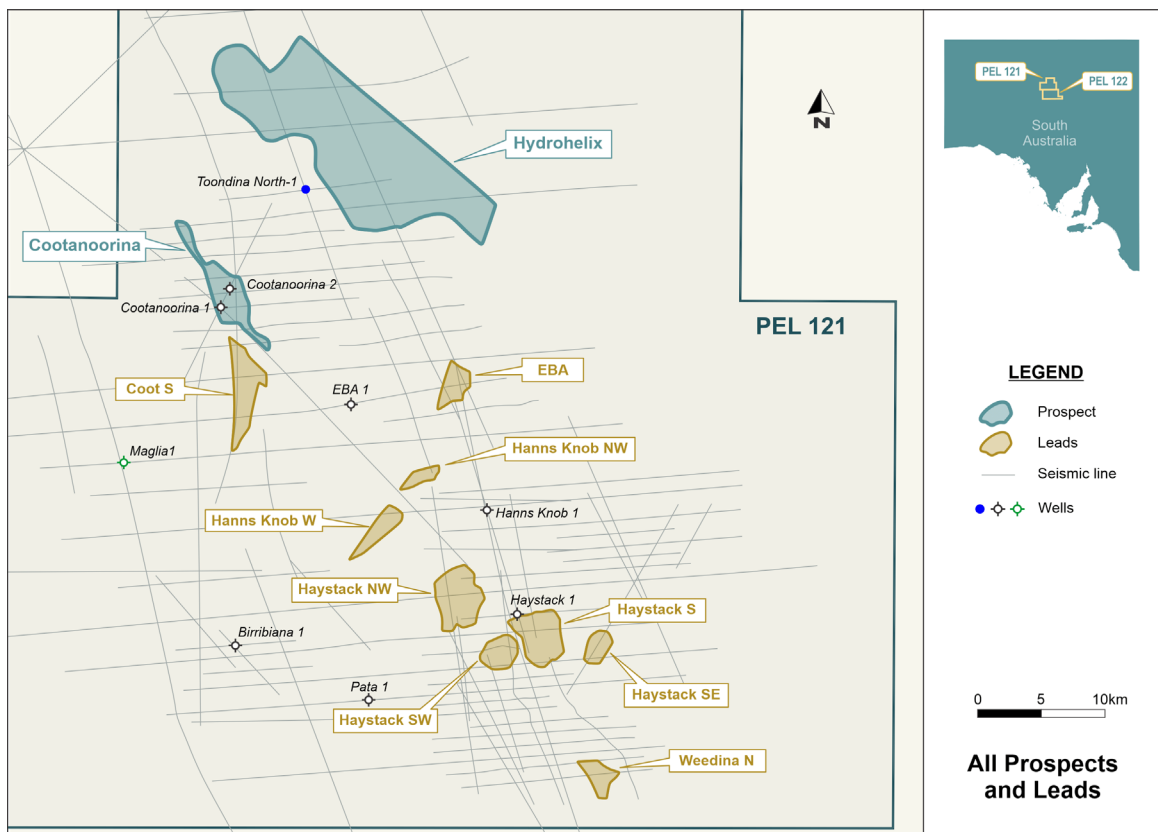
Diagram 1: Arckaringa Project Prospects and Leads

The Company has commenced a farmout process to source a partner to join the exploration effort at Arckaringa. Discussions with prospective farminees regarding the drilling of the Hydrohelix prospect are progressing positively.