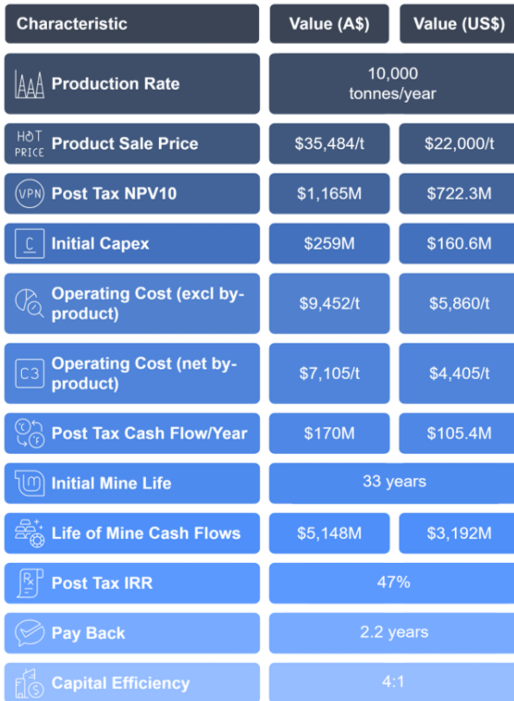
Figure 1.1. Lake Hope PFS Summary Table

In addition, as part of these studies, Impact will focus on the potential integration of the Lake Hope ore and its associated metallurgical processes with the assets and intellectual property related to the HiPurA process, which were recently acquired through Impact's 50% share in Alluminous Pty Ltd (ASX Release April 23 rd 2025).