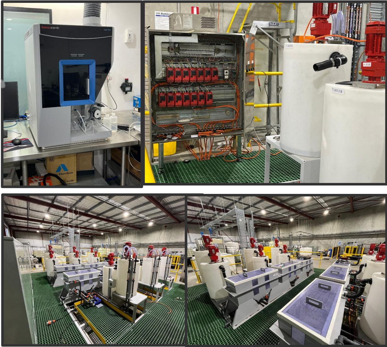
Figure 2.2. Details of the ICP-MS in the high-purity laboratory, the electrical circuits and the SX circuit)