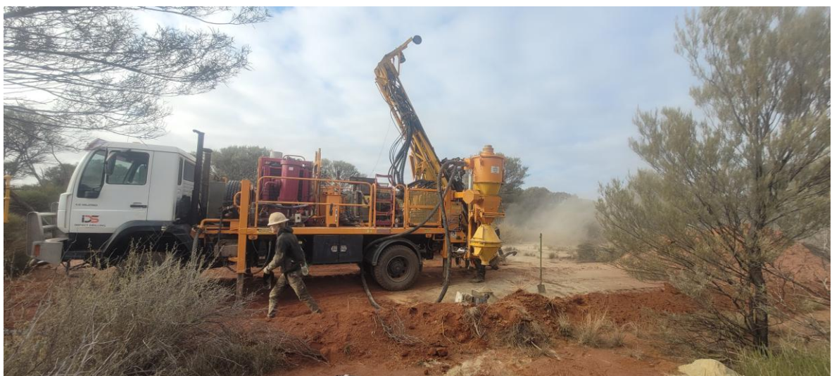
Figure 4 Waste Rock Characterization Drilling at Kangaroo Bore 5 pit