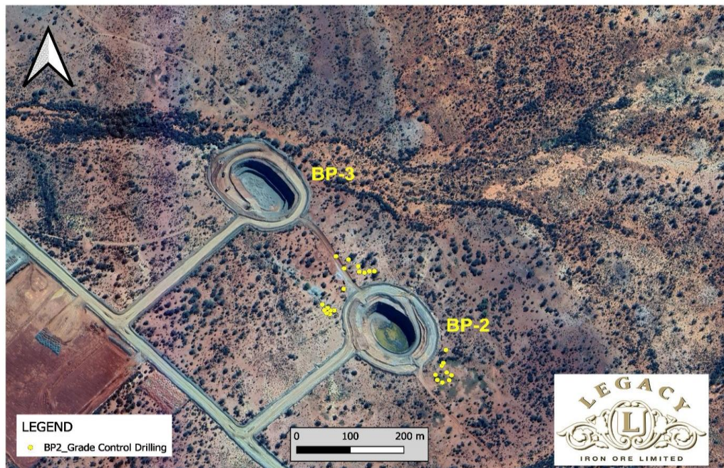
Figure 3 Location map of Grade Control & Resource Definition Drilling at Blue Peter 2