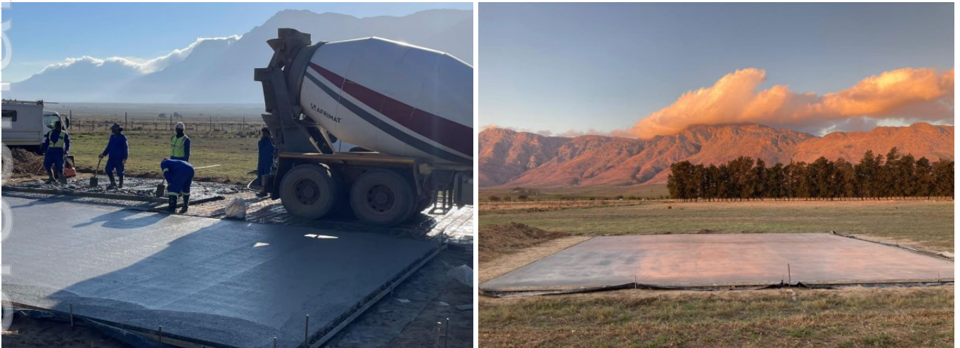
Figure 1: Pouring of the slab at Bontebok Ridge Reserve in South Africa and the slab undercover during curing.

Up to 10,000 litres of the product is being made monthly since its launch, which followed successful trials conducted in collaboration with Glade, Stellenbosch University and industry partners in South Africa.