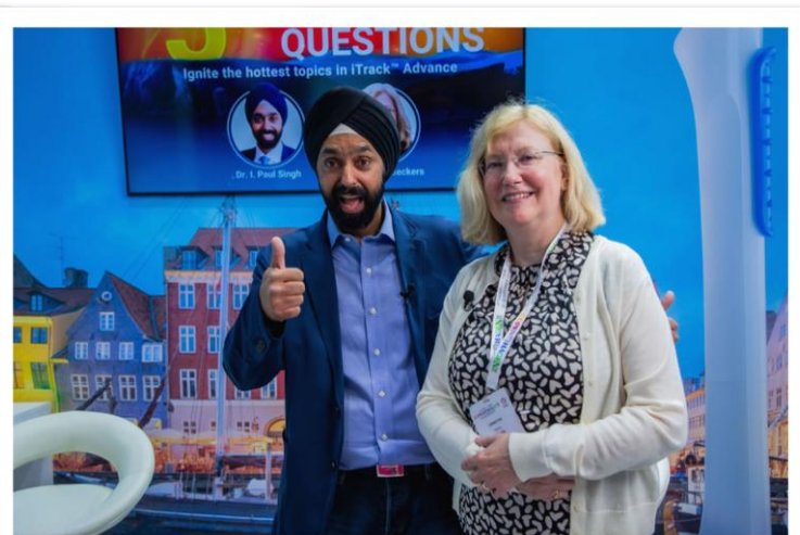
Figures 2 - 5 - Nova Eye Medical at the 43rd Congress of the European Society of Cataract and Refractive Surgeons (ESCRS), Copenhagen, Denmark (September 2025).