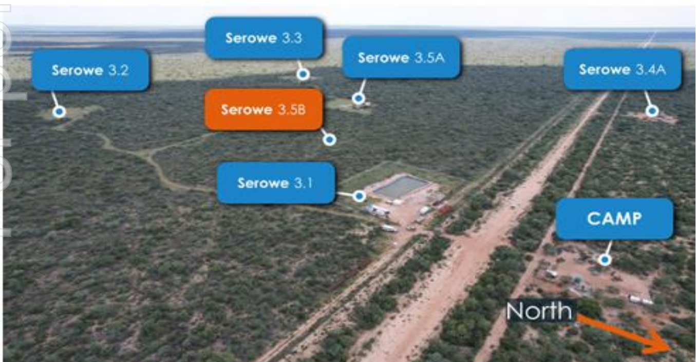
Figure 3. Project Pitse showing commercial well pilot locations.

On 7 July 2025, Botala provided an update detailing the successful completion of drilling at the Serowe-3.4A well, the second well in its Project Pitse pilot cluster. The Company advised of a strategic realignment of Project Pitse to include a new well, Serowe-3.5B to replicate MAS-13's (located in adjacent acreage) sustained flowrate of ~120,000scfd.