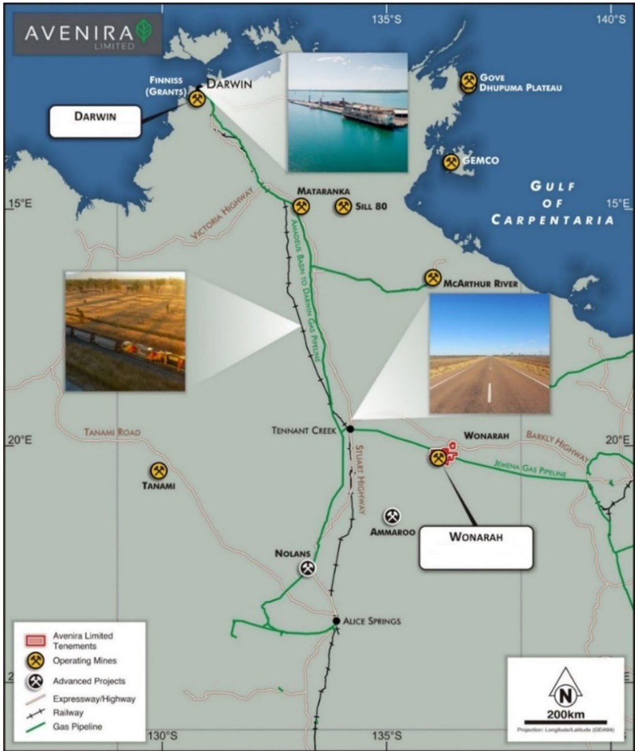
Figure 1: Location map of Wonarah