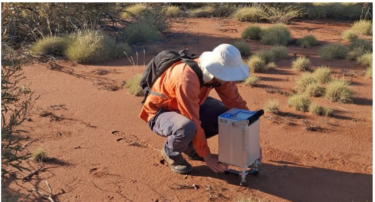
Figure 1. Collecting gravity data across more than 2000 points across the gravity survey area at the Mt McKenna Project location near Laverton.

“The successful completion of these surveys marks another important milestone in our exploration campaign. The gravity data provides an excellent foundation for advancing our understanding of the mineral potential across the project area and preparing for our upcoming aircore drilling program.”