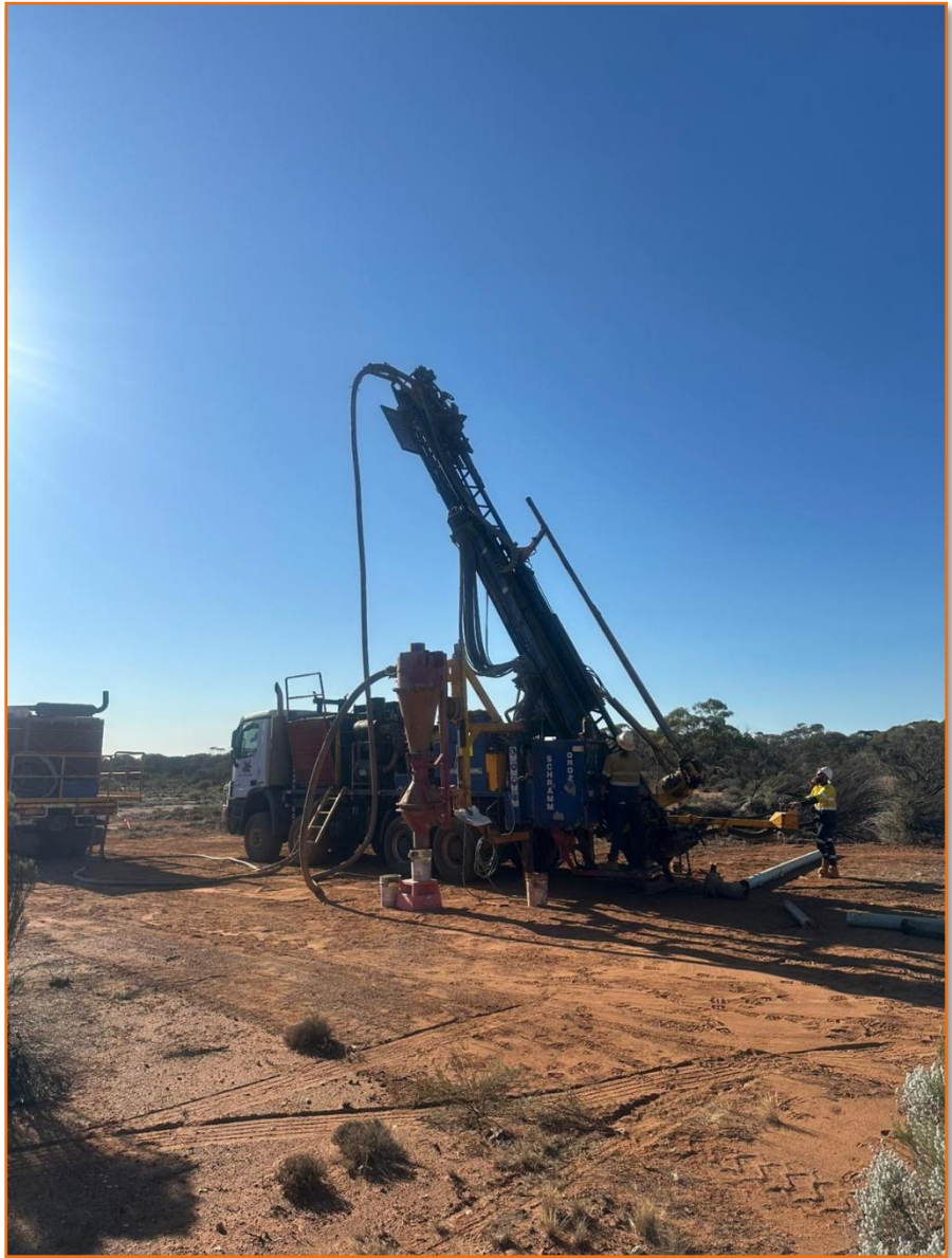
Figure 2 – Drilling at Woodpecker South Prospect