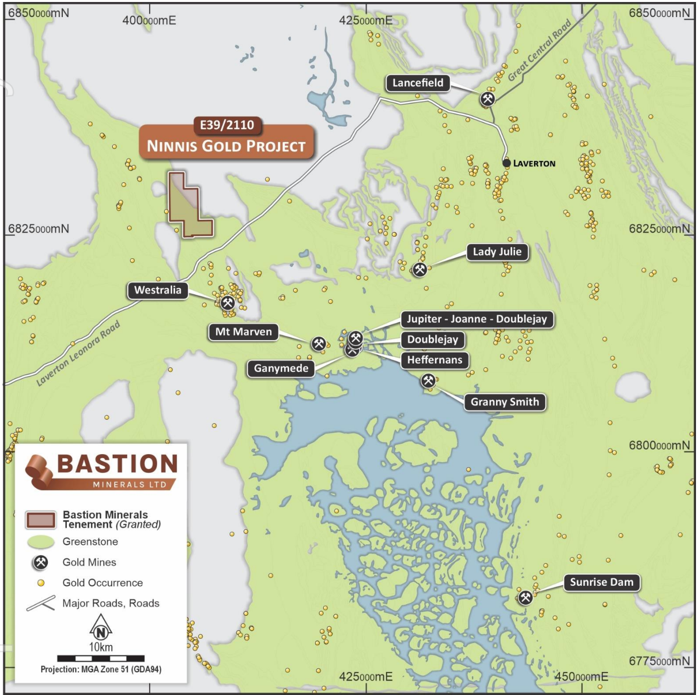
Figure 1: Ninnis Gold Project location