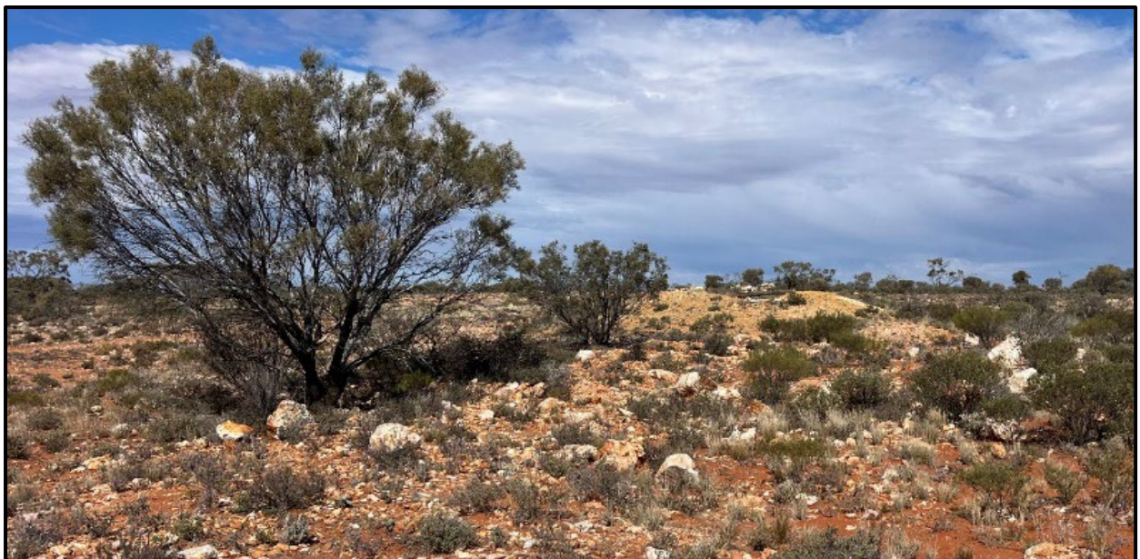
Photo 1: Historic Gold Workings Associated with Extensive Quartz Veining on new tenement E37/1235

“Both exploration licences have extensions of key exploration targets which we have identified from our early work on the Pinnacle Well project and gives us tangible upside at the project.”