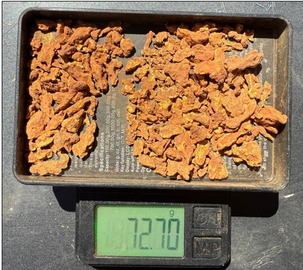
Figure 2. Recent 328 gold nugget haul