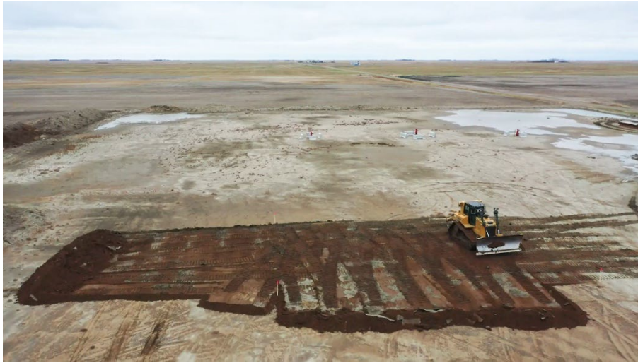
Figure 1: Foundation works on Pad #1