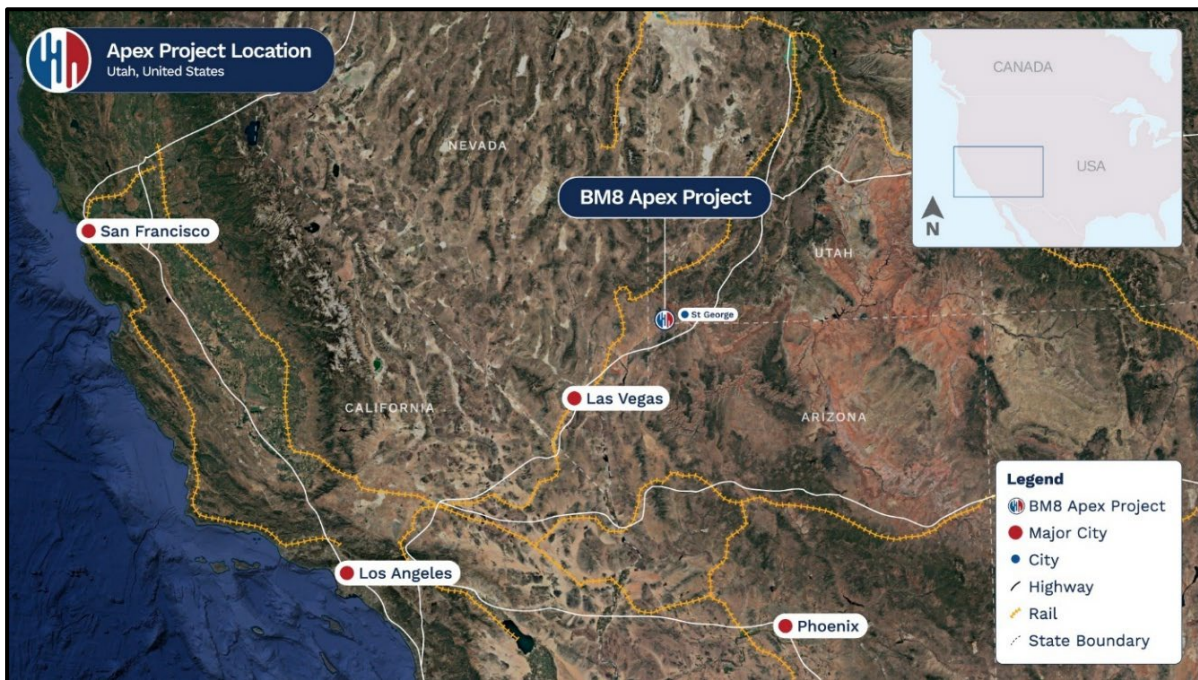
Figure 1: The Apex project, located in south-west Utah, USA

Located on the eastern flank of the Beaver Dam Mountains in southwest Utah, approximately 22 km west of St George and 9 km north of the Arizona border, the Apex Project benefits from excellent infrastructure, including highway access, proximity to power and rail, and year-round field conditions. The project comprises 129 unpatented Bureau of Land Management lode claims covering approximately 2,660 acres, arranged in two contiguous blocks. The claim blocks overlay favourable exposures of the Pakoon Dolomite–Callville Limestone contact, the principal stratigraphic and structural control to germanium-gallium mineralisation at the historic Apex Mine.