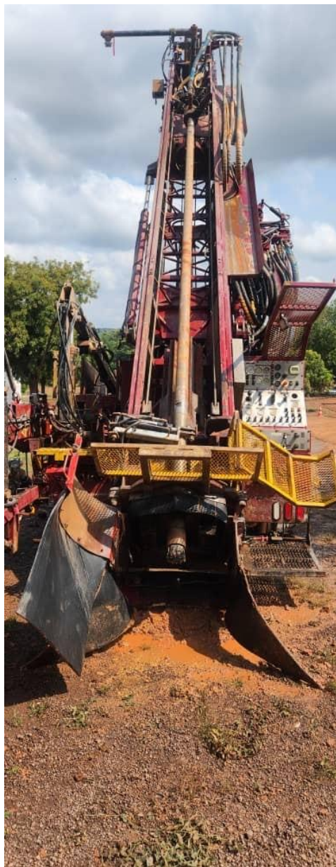
Figure 4: AC drill rig mobilised at the Ibel South Gold Project.