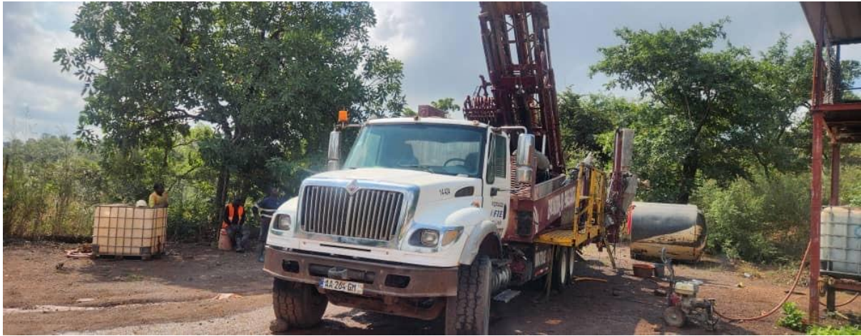
Figure 3: AC drill rig mobilised at the Ibel South Gold Project.