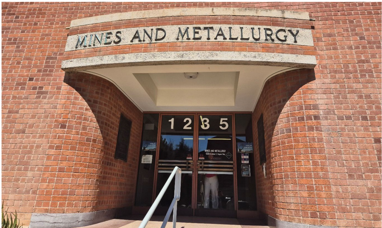
Figure 2: University of Arizona School of Mining Engineering & Mineral Resources.