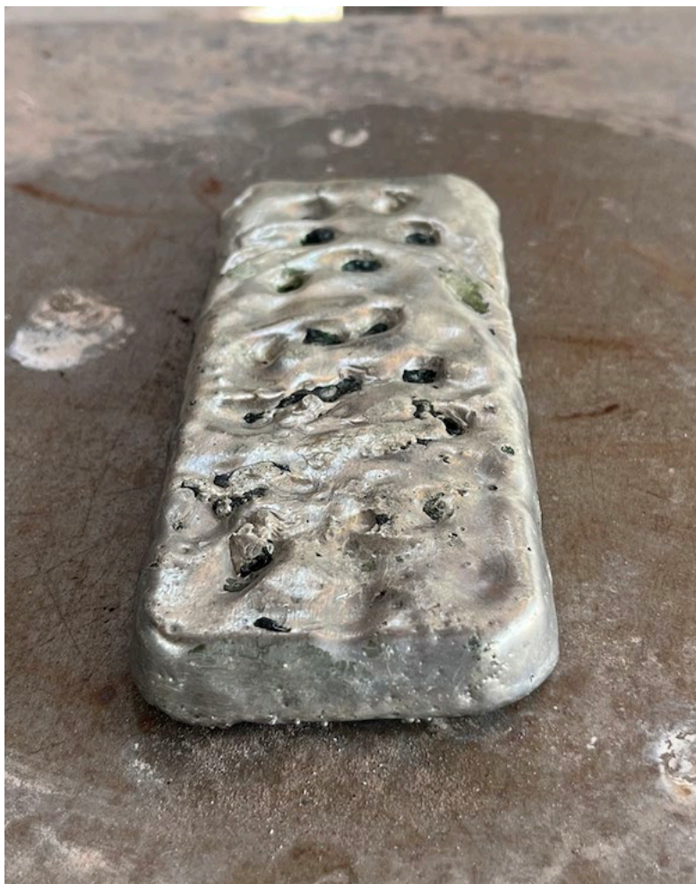
Figure 1: Doré poured at GGPP