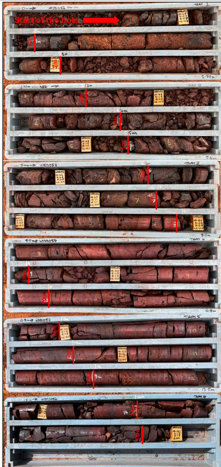
Figure 3. Drill hole WDDD056 twinning hole WDRC056 that intersected 13m @ 59.3% Fe & 0.7% Mn from 1m including 7m @ 62.0% Fe & 0.7% Mn from 7m. Assays quoted from the equivalent interval from WDRC056 to the twin diamond hole will vary due to geological variation and recovered core. High grade iron mineralisation can be observed from 8 to 14m depth. Downhole metre marks are drawn on the core and tray ribs.