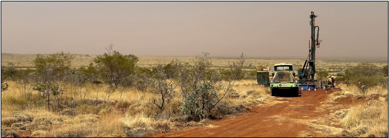
Figure 1. Diamond Drill Rig on site

“With our pre-development activities advancing in parallel with exploration and strong funding support in place, we are well positioned to continue unlocking the value of the Wandanya Project and progress it toward future development.”