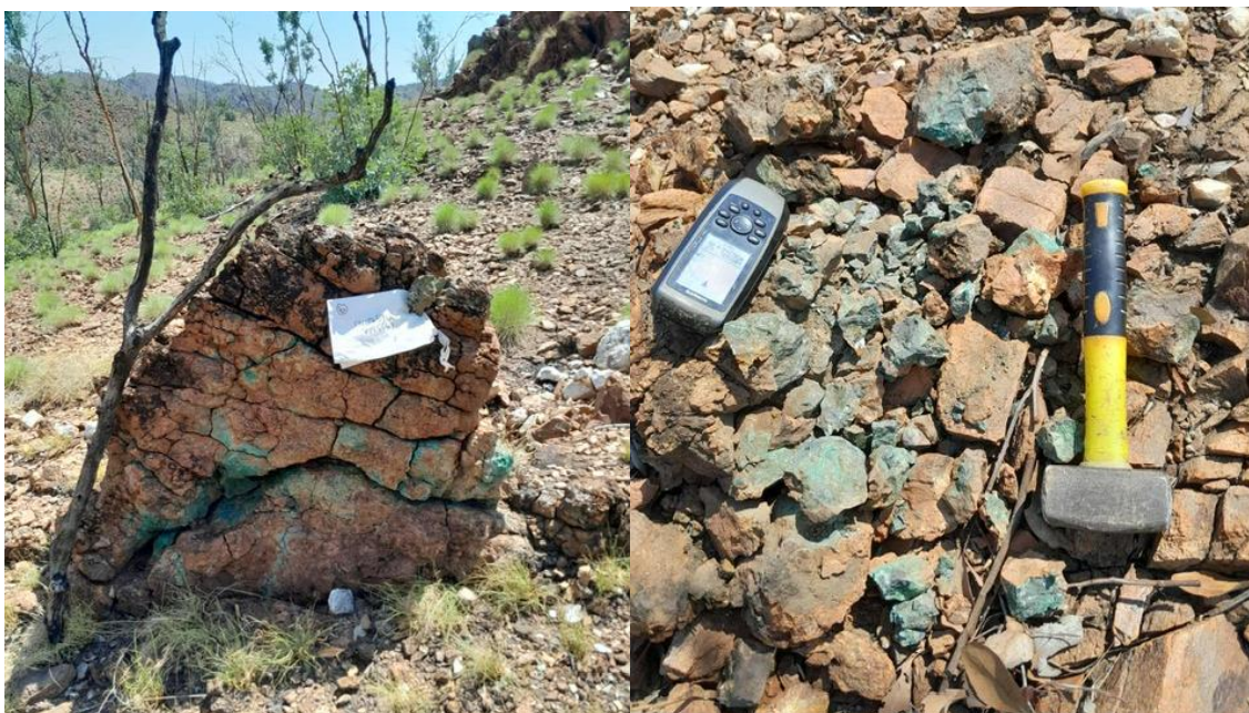
Photo 1 & 2: Copper carbonate outcrop along the northwest - southeast fault surveyed by IP (Red Devil). Sample ID – BDR033: 40.1% Cu, 27.8g/t Ag & 0.113g/t Au.