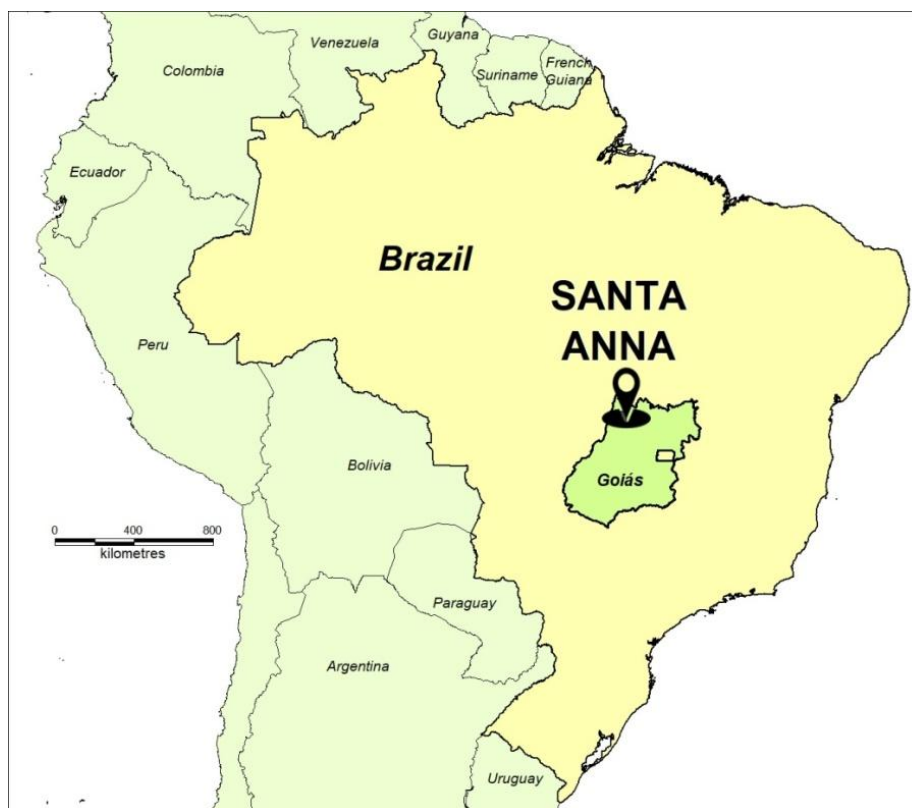
Figure 1 Location of the Sana Anna Project within the Goiás State, central Brazil.

This third phase program will target deeper REE and niobium mineralisation in previously untested areas of the Santa Anna Alkaline Carbonatite Complex with an initial 2000m of RC drilling for an anticipated 40 holes. It will systematically extend the drilling to test the deeper portions of the carbonatite complex. This will build on the extensive data set existing over the alkaline complex. Most early drilling by project vendors, EDEM, targeted phosphate mineralisation, and large areas have no sampling data at depth.