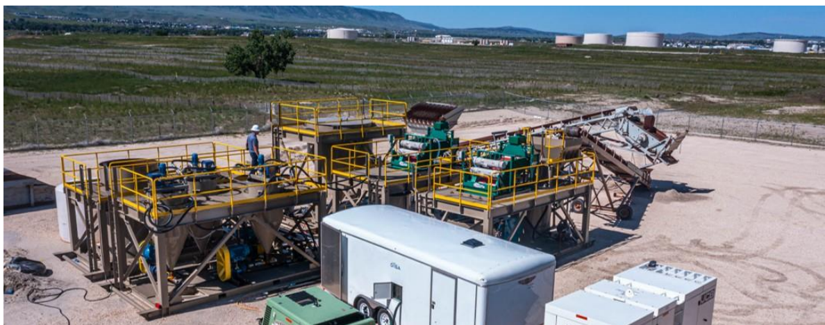
Figure 1. Gen 8 modular HPSA components

Mandrake Resources Limited (ASX: MAN) (Mandrake or the Company) is pleased to announce the signing of a non-binding Term Sheet with DISA Technologies Inc. (DISA) to evaluate the potential use of DISA's patented High Pressure Slurry Ablation (HPSA) technology to treat and recover uranium and other critical minerals from abandoned mine waste (AMW) material located within Mandrake's 100%-owned 93,755 acre (approximately 379 km 2 ) Utah Project.