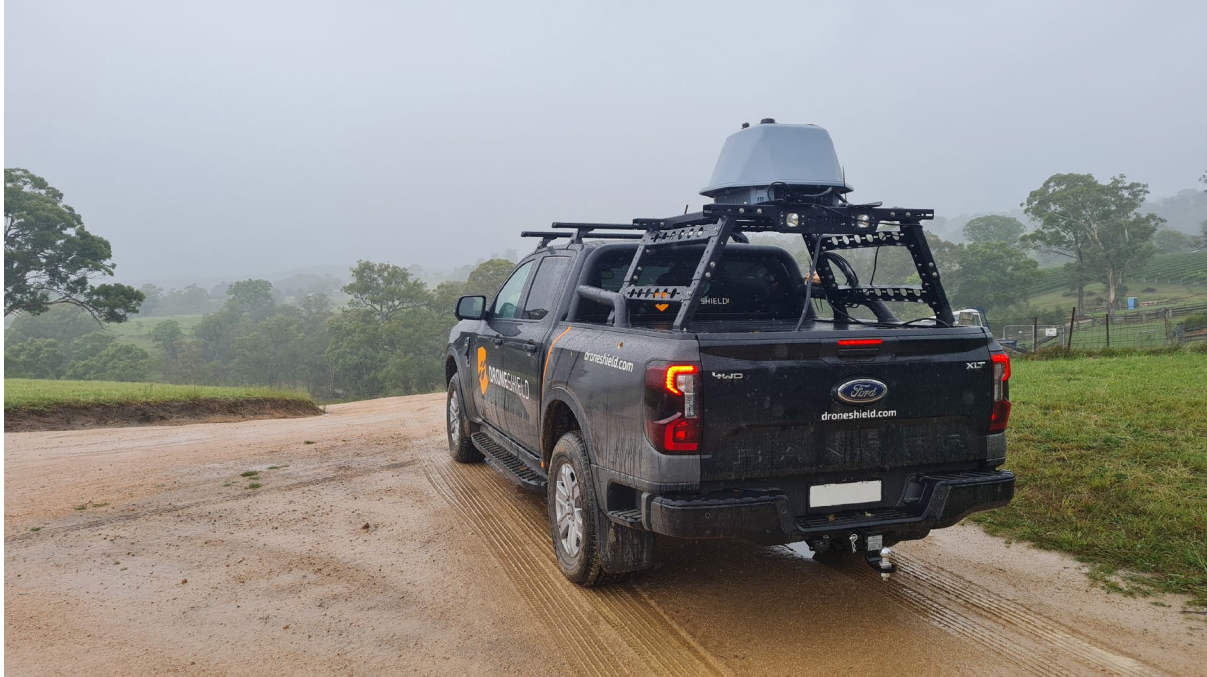
Image: DroneShield DroneSentry-X detect and defeat system

Operationally, DroneShield continues to execute on production expansion from $500 million annually to $2.4 billion by end of 2026, including commencement of European and US based assembly plants.