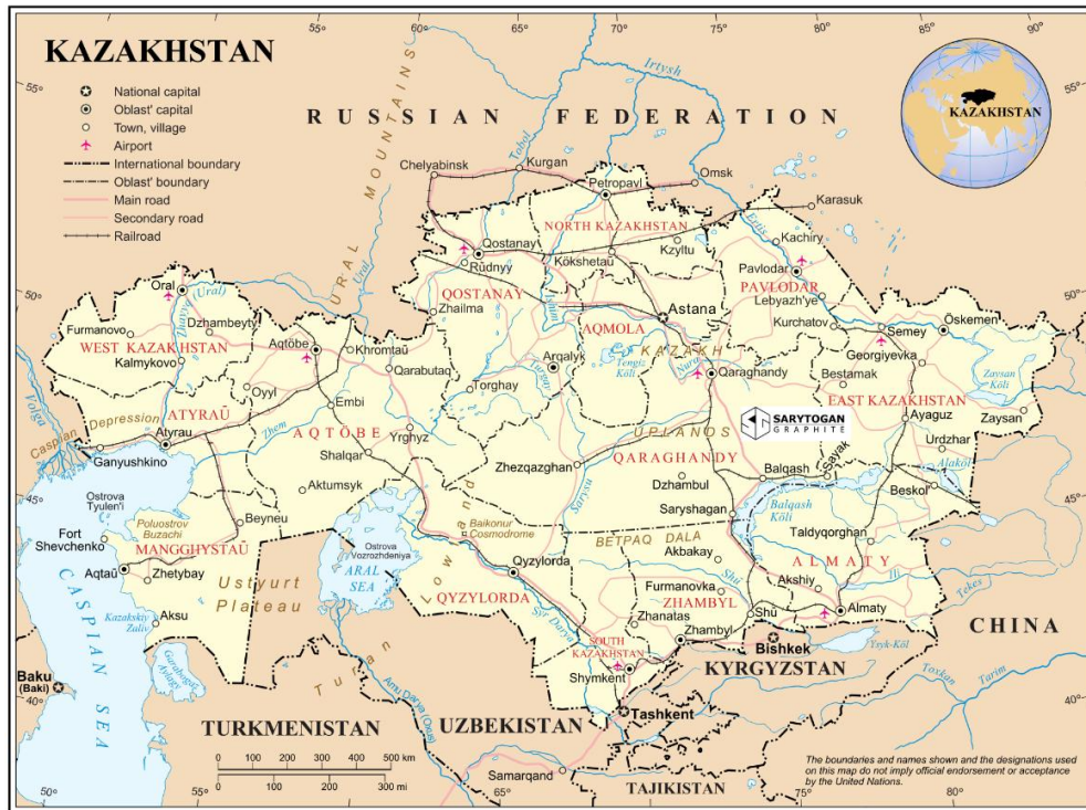
Figure 2 - Sarytogan Graphite Deposit location.

The Sarytogan Graphite Deposit was first explored in the 1980s with sampling by trenching and diamond drilling. Sarytogan's 100% owned subsidiary Ushtogan LLP resumed exploration in 2018. An Indicated and Inferred Mineral Resource has recently been estimated for the project by AMC Consultants totalling 229Mt @ 28.9% TGC (Table 2), refer ASX Announcement 27 March 2023).