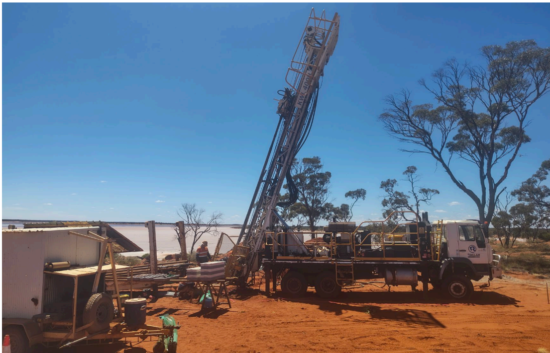
Figure 1: Burns High-Grade Metallurgical Diamond Drilling Program (In Progress)