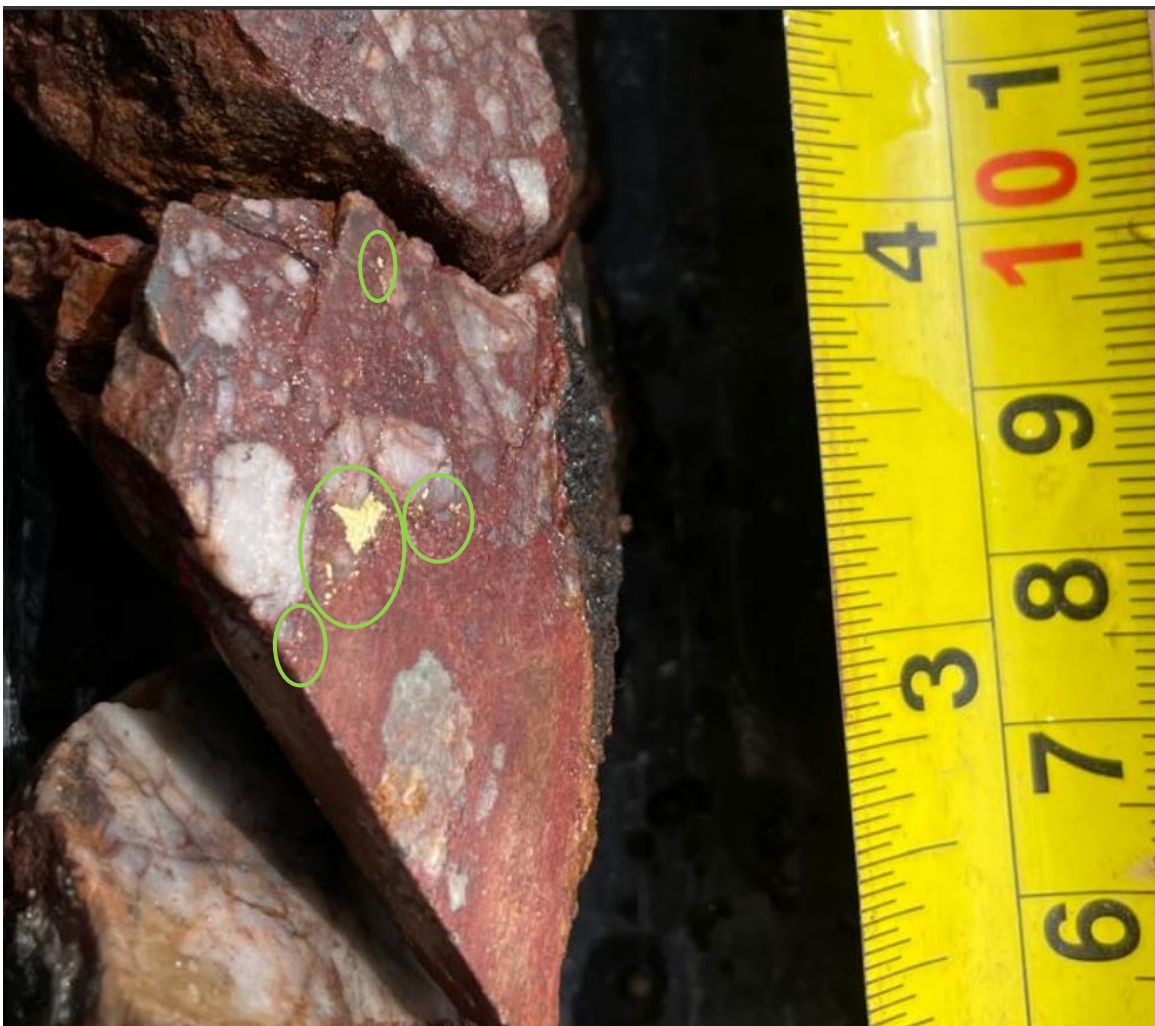
Figure 1: Visible Gold in oxidised brecciated quartz vein, intersected at 89.47m down hole in SDH25-009