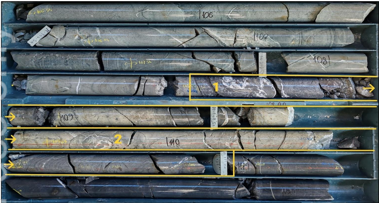
Figure 5 Photo of the mineralised antimony zones (yellow box) within drillhole DD25ZOP014 showing massive stibnite and quartz (~90% antimony) zone transitioning stringer veins of quartz – sulphide – stibnite within the parent rock (noted by 2). Drilling prior to the antimony zone is enriched in arsenopyrite sulphide alteration which may contain gold. Drilling stopped in antimony rich mineralisation. Assays are pending for this hole and are expected in December 2025 to January 2026. Note: Visual estimates of mineral abundance should never be considered a proxy or substitute for laboratory analyses where concentrations or grades are the factor of principal economic interest. Visual estimates also potentially provide no information regarding impurities or deleterious physical properties relevant to valuations.