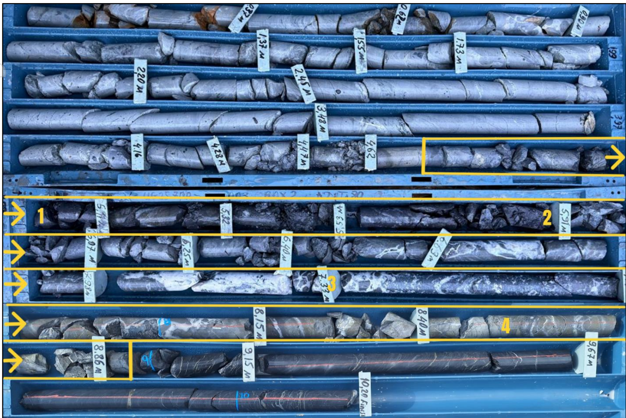
Figure 4 Photo of the mineralised antimony zones (yellow box) within drillhole UG25ZOP003 showing area from reference point 1 to 2 as a massive stibnite (>80%) zone and a zone of quartz – sulphide - stibnite breccia (noted by 3; see closeup in Figure 1) and antimony veinlets 4. Drilling prior to the antimony zone is enriched in arsenopyrite sulphide alteration which may contain gold. Assays are pending for this hole and are expected in December 2025 to January 2026. Note: Visual estimates of mineral abundance should never be considered a proxy or substitute for laboratory analyses where concentrations or grades are the factor of principal economic interest. Visual estimates also potentially provide no information regarding impurities or deleterious physical properties relevant to valuations.