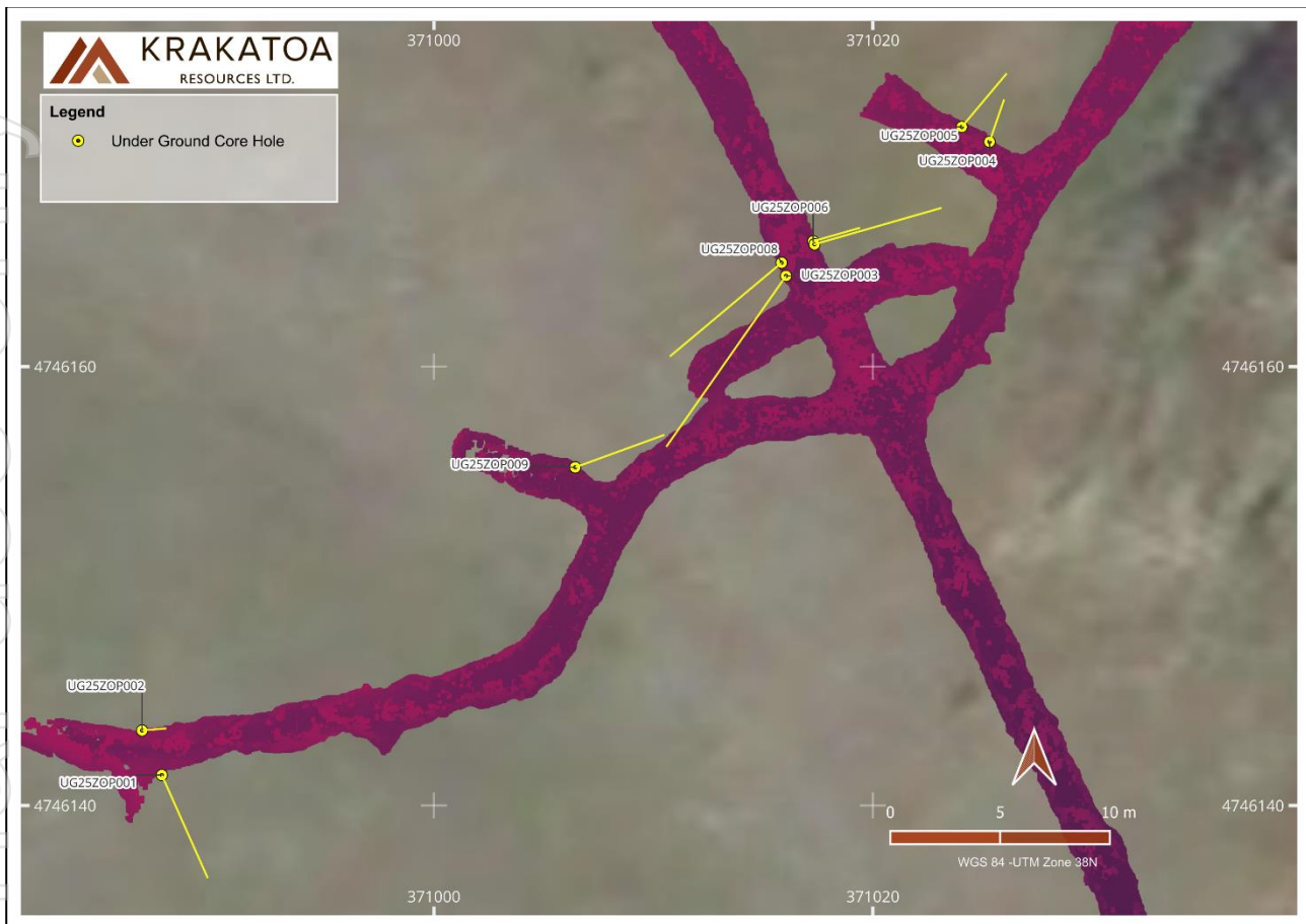
Figure 3 Plan view showing the locations of the underground core sampling drill holes in relation to the adit LiDAR surface profile.

The in-adit drilling is currently being undertaken within Adit #80. The first 9 holes have been completed, with visual results indicating 7 holes intersecting antimony mineralisation and all holes intersecting an arsenopyrite sulphide dominated halo which from historical assays may contain gold.