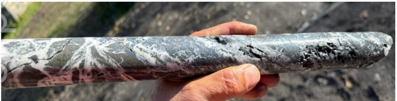
Figure 1 Core from drillhole UG25ZOP003 (~7.3m depth) showing the vein system with a zone of quartz - sulphide breccia. Antimony sulphides (Stibnite Sb_2S_3 ) in this interval constitute ~30% of the rock shown. Assays are pending for this interval and are expected December 2025 to January 2026.

Krakatoa Resources Limited (ASX: KTA) (“Krakatoa” or the “Company”) is pleased to provide an update on drilling activities at the Zopkhito Antimony-Gold Project in Georgia, Eastern Europe.