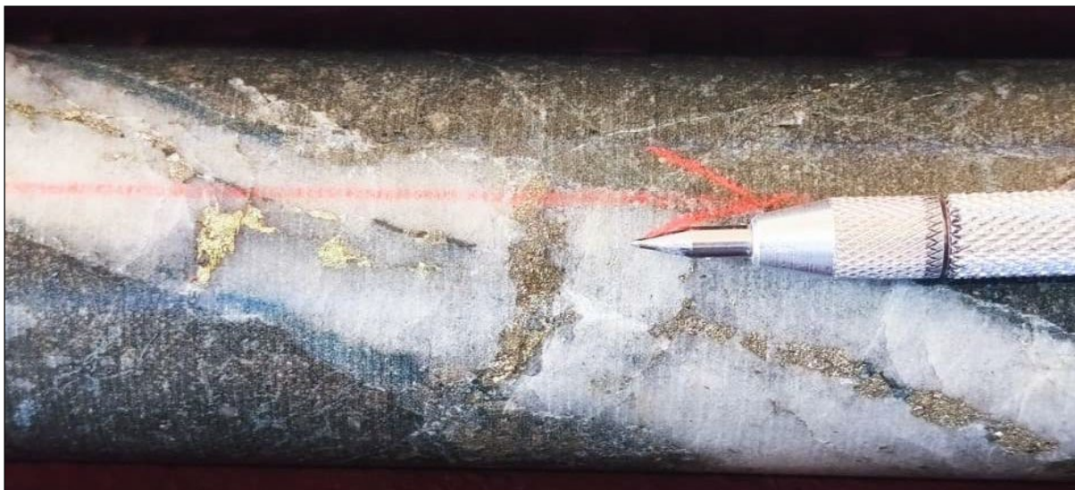
Figure 1: Core photo from CANDD01 showing copper sulphide (chalcopyrite – brassy yellow colour) and pyrite mineralisation within a quartz vein at down-hole depth of 729m. Visual estimates of sulphide percentages are provided in Table 1)

Preliminary visual assessment of core from the first diamond drill hole (CANDD01) indicates the stockwork vein system cutting the host volcanics is at least double the vertical depth of the current Reverse Circulation (RC) drilling, with chalcopyrite (copper sulphide) mineralisation intersected in veins at depths around 800m (down-hole) ( Figure 1 ).