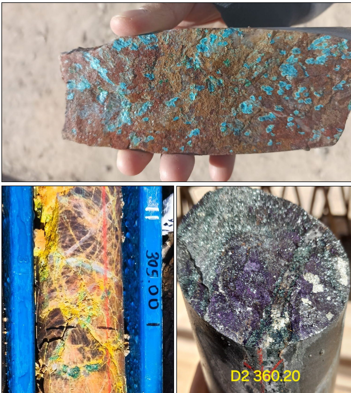
Figure 2: Core photos from CANDD02 showing copper oxides (chrysocolla, atacamite and malachite) within stockwork veins at depths of 78m (upper photo) and 305m (bottom left). Bornite mineralisation (purple mineral) with chlorite (green mineral) from 360m is shown in bottom right photo.

The second diamond drill-hole (CANDD02) which is currently in progress, has intersected a broad zone of copper oxide mineralisation from surface to depths in excess of 300m (Figure 2). Within this zone there is strong evidence that supergene processes are active in the area, which could result in copper enrichment within the upper parts of the profile.