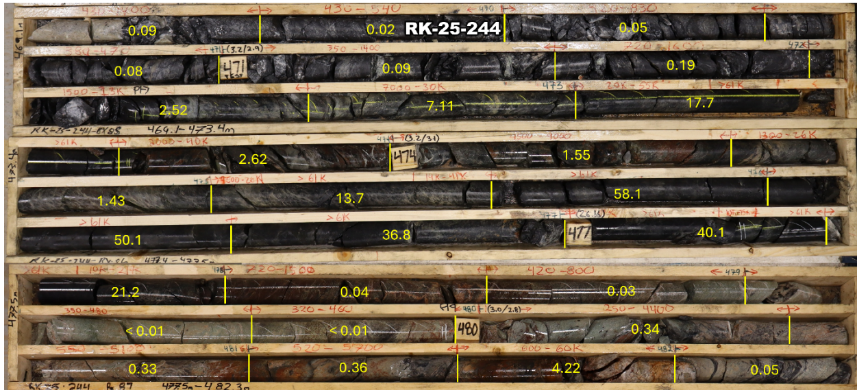
Figure 3: Core photo with assays from RK-25-244, grades are shown as % U_3O_8