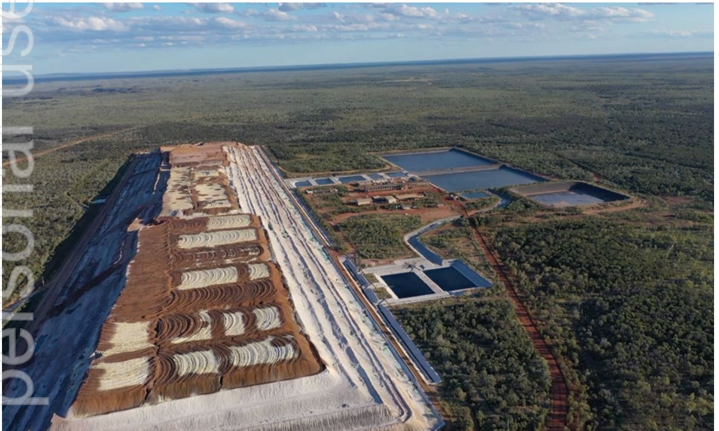
Figure 2: Aerial view of Austral's Mt Kelly processing facility

The proposed operation is designed to leverage the site's existing footprint, including previously disturbed pits and infrastructure, minimising surface impact and supporting New Frontiers's commitment to responsible development.