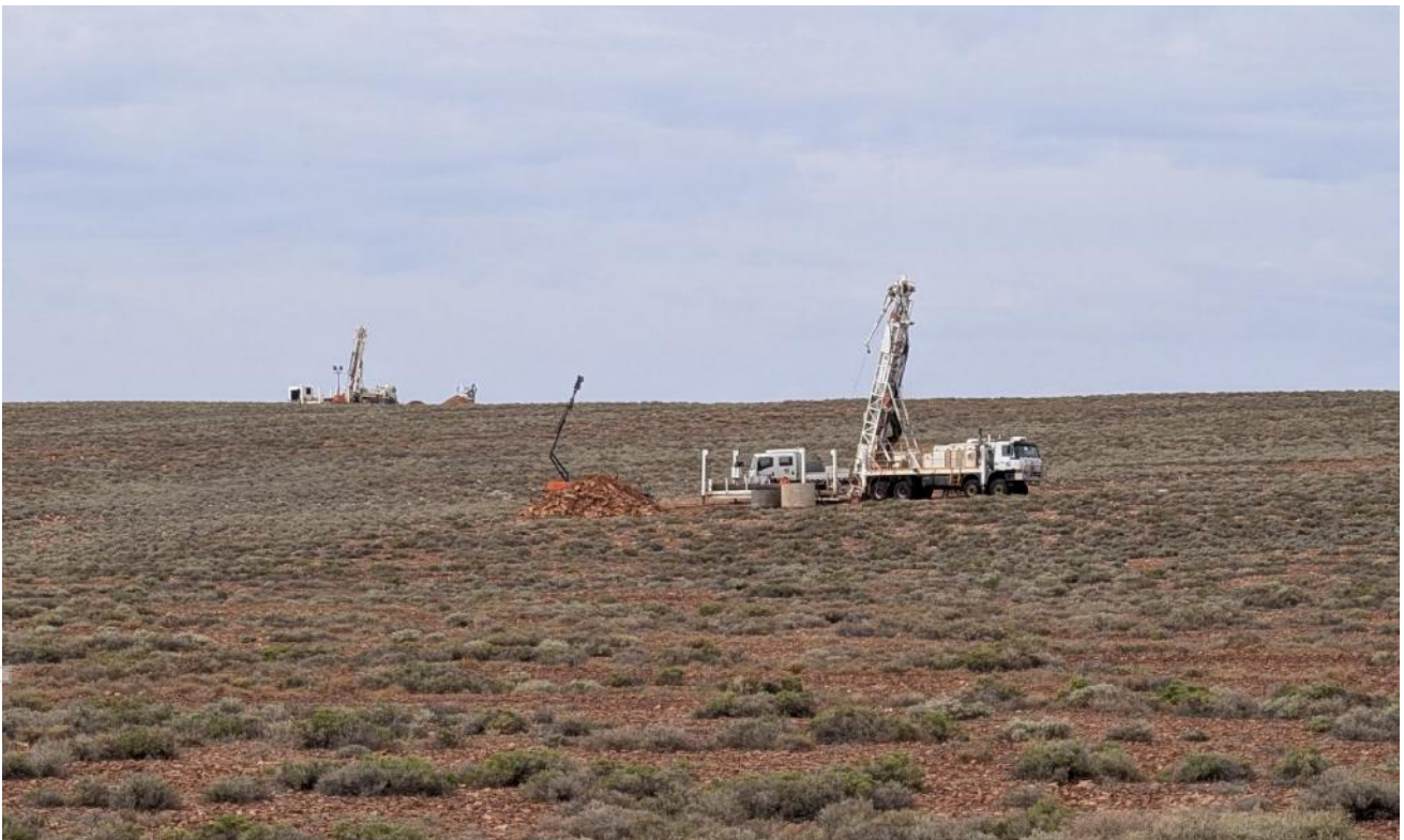
Figure 1 Drill rigs and in operation at the Emmie Bluff deposit, in the north of the Elizabeth Creek project.

"Importantly, it will also generate the metallurgical samples needed to continue advancing our whole-ore chloride leach processing flowsheet . That approach has already had a transformational impact on project economics by shifting Elizabeth Creek's value squarely toward copper and silver, both of which are experiencing strong demand fundamentals. Through this programme, we are taking the next step in refining that flowsheet and ensuring the PFS is built on the strongest possible technical foundations."