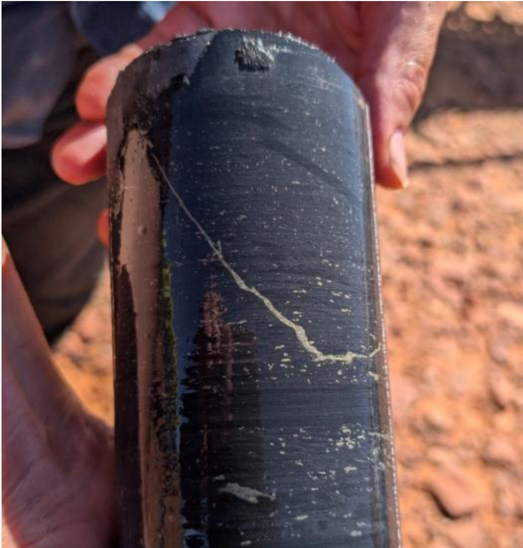
Figure 2 Tapley Hill Formation PQ drill core from approx.. 398m ,DD25EB0042. Sulphide abundance is estimated at approx. 1-3% chalcopyrite, 1% pyrite.